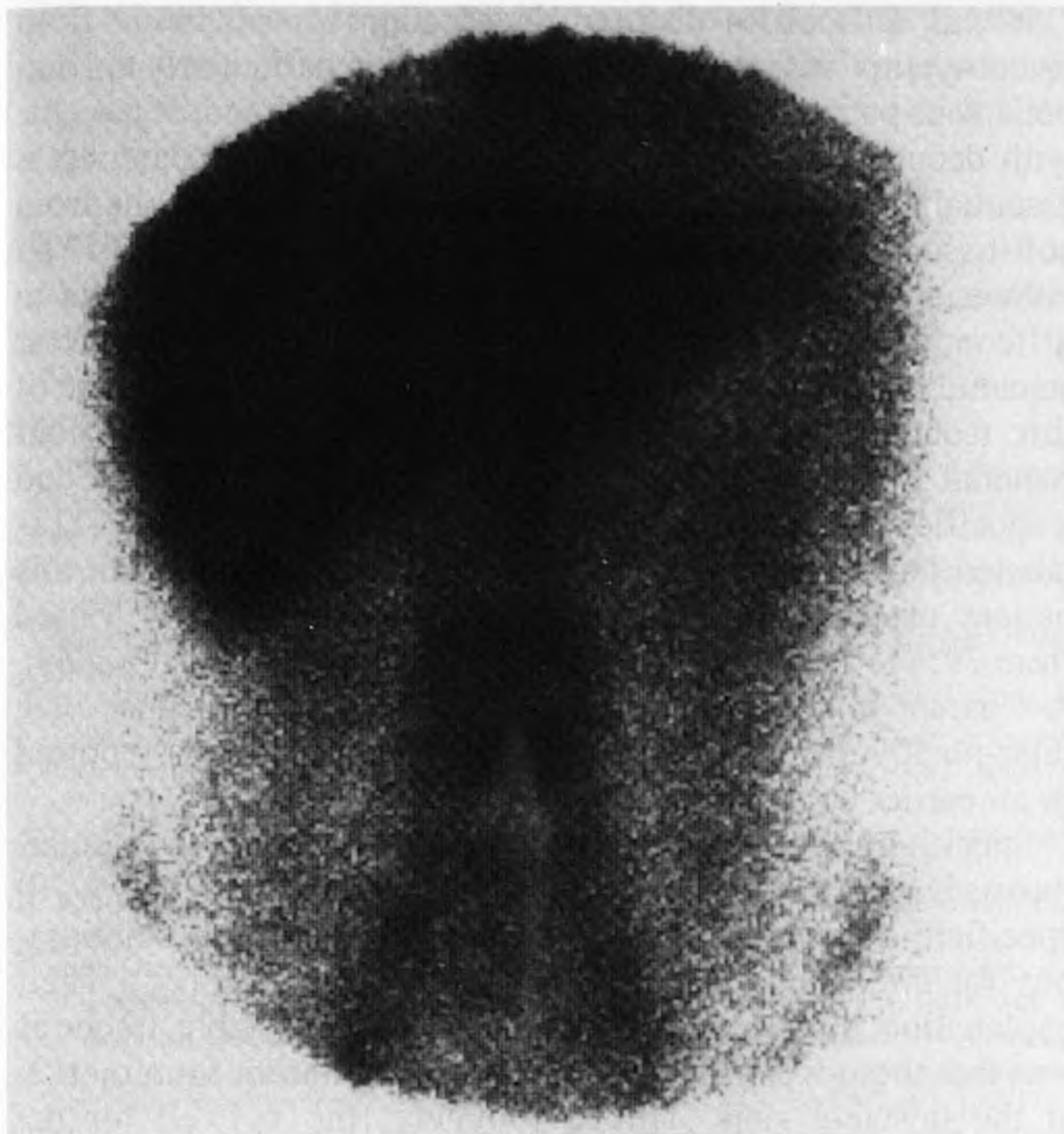
FIGURE 3. Indium-111-IgG scintigram of a 35-yr-old male patient with low back pain. Focal 111 In-IgG accumulation is seen on the ventral side of the vertebra L3–L4. Biopsy of the vertebra L3–L4 proved infection ( K. denitrificans ).

infection, paraneoplastic polyarthritis and seronegative symmetric polyarthritis. Those joints showed an increased accumulation on 111 In-IgG scintigraphy but with a different distribution pattern compared with septic arthritis as seen in five other patients. In infectious arthritis, diffuse, intense uptake is seen in the joint, whereas in sterile arthritis typically the synovial lining is visualized.