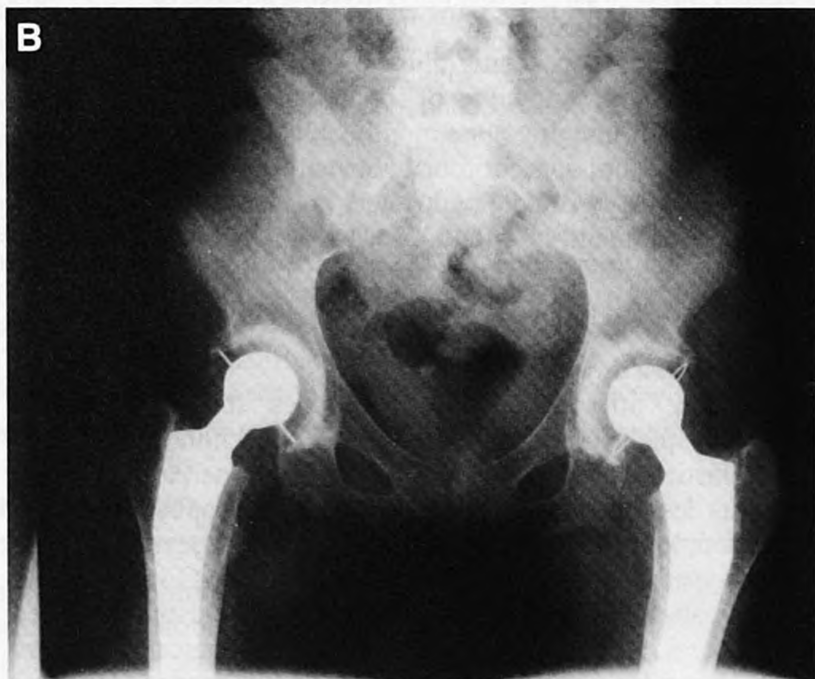
FIGURE 1. Female patient (age 22 yr) with a painful cemented right total hip arthroplasty 4 yr after implantation. Cultures from needle aspirations and blood cultures grew Staphylococcus aureus . (A) Indium-111-IgG scintigram showing increased uptake of radionuclide. (B) Plain radiograph showing no signs of infection.

performed. In this patient, it was not possible to differentiate between increased ^{111}\text{In} -IgG uptake in soft tissue or bone. In the second patient an above-knee amputation was performed 10 mo before scintigraphy due to a late complication of diabetes mellitus. A fistula at the amputation side existed for several months. Culture of the pus revealed S. aureus in low counts. No evident signs of osteomyelitis were seen on plain radiography. Indium-111-IgG scintigraphy was scored as false-positive because the wound healed within 4 wk after scintigraphy, 3 wk after oral antibiotics only (amoxicillin-clavulanic acid).