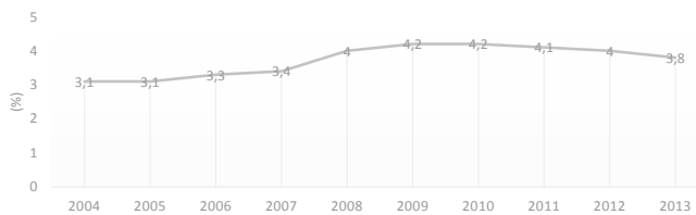
Figure 1. UAE's unemployment rate (%)

To signify its improved economic stability, the country has an unemployment rate of about 3.8 percent, which is actually below the natural unemployment rate that is usually brought about by both frictional and structural unemployment which is usually at the rate of about 5 percent (Figure 1).