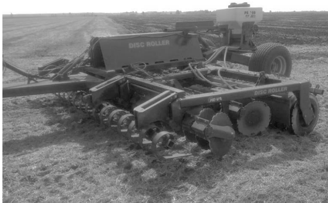
Figure 2. Modern disc harrow with rolls and mounted pneumatic seeder on Farm4

At summer time, sowing catch crops – like millet, phacelia or mustard – for green manure has a doubtful result. Farm4 purchased a small pneumatic seeder mounted on a disc harrow to cultivate stubble and sow cover crops at the same time; this produces time, fuel consumption and preserves precious water in summertime ( Figure 2 ).