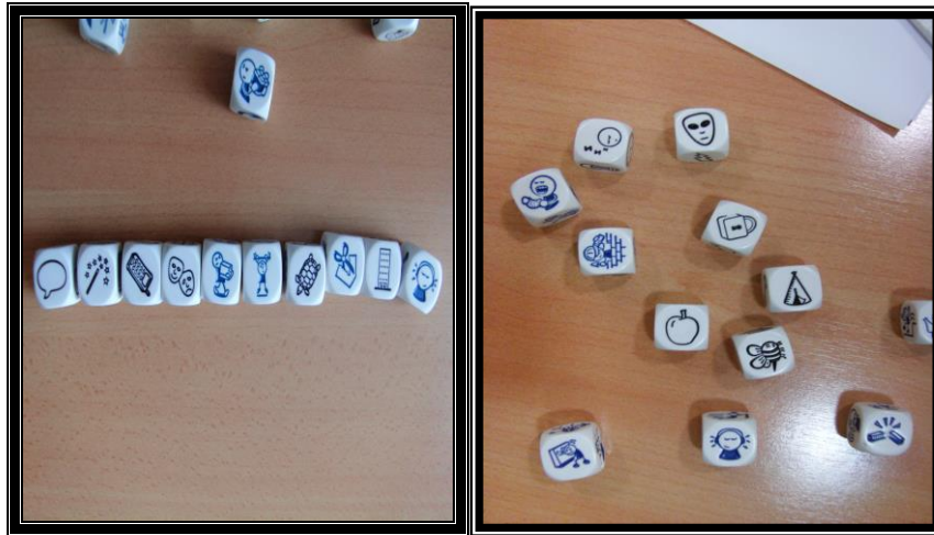
Illustration 3.: Visual constructs (hierarchies)

Pessimism. Under conditions of multiple hierarchies personal success is hardly imaginable. Students mainly foresee discouraging future perspectives: