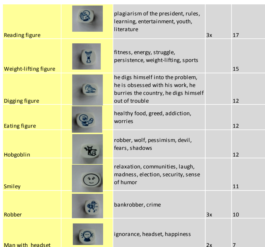
Table 2. : Primary associations

A quick overview of the first half of the table makes it possible to sense the negative universe that is evident at the level of primary associations. Although significantly more cubes align with positive meaning (17) than with negative (12), respondents connected even undoubtedly