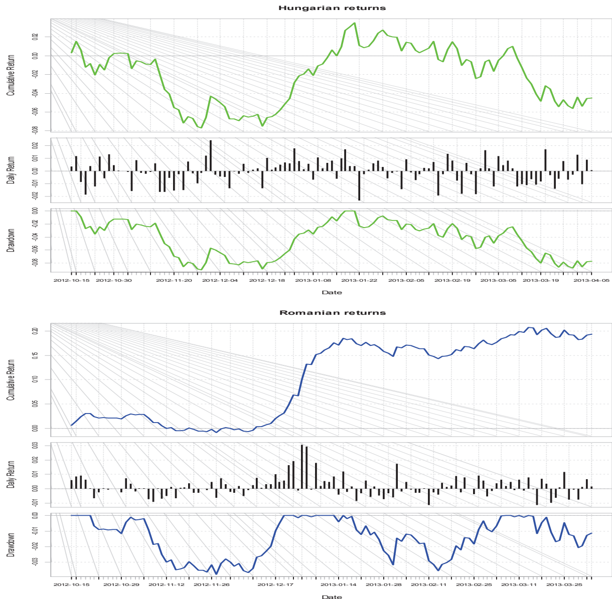
2. Figure: The cumulative, daily, drawdown of Hungarian and Romanian returns

The Figure 2 presents first the cumulative returns, which shows the aggregate amount of gains or loss in certain period. By analyzing this figure, we can observe a more abrupt line in the case of Hungarian returns, with significant decreases at the end of year 2012, and increases in next period, the begin of 2013. Approximately, the same trend can be observed in the case of Romania, with difference that in the first period, the amplitude of decreases it isn't very important, and in the last period, at Romania, we assist to a slowly increase, while in Hungary the contrary can be observed. The drawdown represents a very good measure of portfolio risk, because shows the decline between peak of return to trough in certain period. At Hungarian portfolio, the trend of drawdown follows nearly the evolution of cumulative return, while at Romanian portfolio the evolution is sharper. The Romanian returns drawdown's also follows the line of cumulative returns, with more accented evolution in some places.