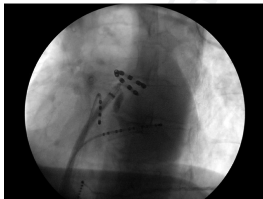
Fig. 3. Thrombus formation on the tip of a steerable sheath in the left atrium. Thrombus attached to the tip of the sheath is visible on fluoroscopy after contrast injection.

Long sheaths, including those used to establish LA access during transseptal puncture and steerable sheaths designed to facilitate maneuvering in the LA, pose well-known hazards of air embolism during injections or flushing through these devices, and also during catheter exchange, as removal of the catheter can create a vacuum inside the lumen. These devices, mostly at their distal segment, are a source of thrombus formation, especially in the absence of appropriate and timely anticoagulation (Fig. 3). Continuous flushing