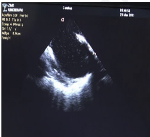
Fig. 1. Microbubbles detected by phased-array intracardiac echocardiography.

Limited data are available on the number of MES during LA ablation for AF. Kilicaslan and colleagues 45 compared MES counts recorded during PV antrum isolation with ICE-guided power titration (as described earlier) versus that with conventional power-limited RF delivery in 202 patients. A good correlation was found between the intensity of bubble formation and the MES count. The power titration strategy resulted in half the total number of MES (mean = 1015) in comparison with the conventional approach (mean = 2250), and acute neurologic complications occurred in 0.9% and 3.1% of patients, respectively. Sauren and colleagues 46 reported a virtually negligible number of MES (mean = 5) during epicardial AF ablation in comparison with endocardial ablation (mean = 3908). In another study from the same group, 30 the MES counts detected during AF ablation demonstrated significant differences between 3 different techniques (cryoballoon, irrigated RF, and nonirrigated RF), in line with previous MRI results. Nagy-Baló and colleagues 36 recently reported on the results of intraoperative TCD and ICE recording in 34 patients undergoing PVI with either cryoballoon or phased-RF ablation. It is noteworthy that multifrequency TCD capable of