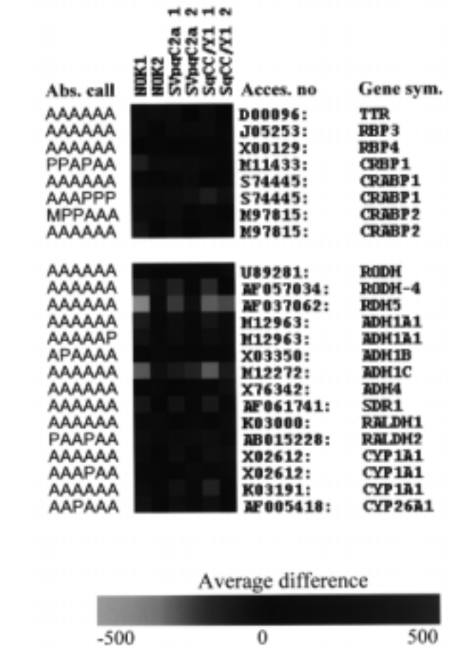
Figure 1. Expression pattern of genes involved in retinoid binding and metabolism as detected by Affymetrix gene array in NOK, SVpgC2a and SqCC/Y1. The colour code used to express the average difference is shown below the gene panels. A, absent; P, present; M, marginally present.

Preparation of labeled cRNA. Methods for cRNA preparation, the hybridisation reactions and data analysis were provided by the manufacturer (Affymetrix). Briefly, total RNA was prepared with RNeasy (Qiagen) from 3 \times 10^6 cells of each type. Double-stranded cDNA was synthesized from 25 µg total RNA using a cDNA synthesis kit (SuperScript Choice