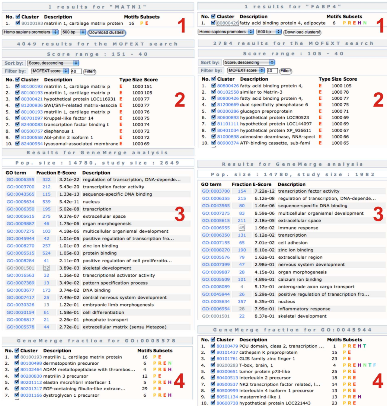
Figure 2 Mofext and GeneMerge analysis of the 300 base pair upstream region of the matrilin-1 and the FABP4 genes. We downloaded the 500 base pair promoter region of the matrilin-1 (A1) and FABP4 (B1) genes. We used the last 300 base pair of these sequences as a query in the Mofext search with the following parameters: wordsize: 8, cutoff: 70 and the 1000 base pair E subset (A2 and B2). After the Mofext search we got 30548 ( MATN1 ) and 23463 ( FABP4 ) hits. We used the score range 151-40 ( MATN1 ) and 105-40 ( FABP4 ) for the GeneMerge analysis (A3 and B3). The genes in the GO term "Extracellular matrix (sensu metazoan)" are listed in the panel A4. Some genes in the GO term "positive regulation of transcription from RNA polymerase II promoter" are listed in the panel B4.