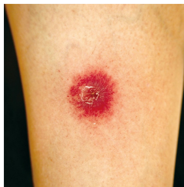
Figure 1 Small, red papules on the extremities with ulcerations.

Following a failed course of infliximab (because of lack of response), adalimumab (Humira; Abbott Laboratories) was proposed as an alternative treatment. Adalimumab was administered subcutaneously at a dose of 80 mg/wk for the first 2 wk followed by 40 mg/wk afterwards. In addition, the patient was treated for a limited period with high doses of parenteral