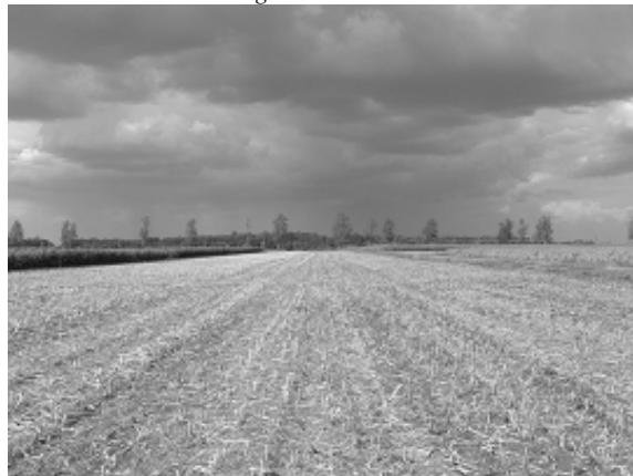
Figure 1.:Plot H-1

The experiment was set on two plots. Plot I-2 ( Figure 2. ) of 9.4 ha is divided into four sub-plots according to the treatments. In this experiment tillage systems of direct seeding and reduced tillage based on mulching were compared to the conventional cultivation system based on ploughing. The soil type of the investigated plot is meadow chernozem solonetzic in the deeper layers, a soil type that is characteristic for the Trans-Tisza Region of Hungary.