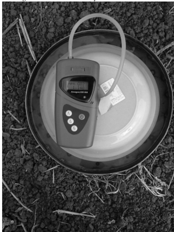
Figure 3.: The infrared analyser and frame+bowl set

After measures we collected data into database by Microsoft Office Excel. So the measured ppm concentration degrees were calculated into CO 2 -emission which unit is g*m -2 *h -1 .