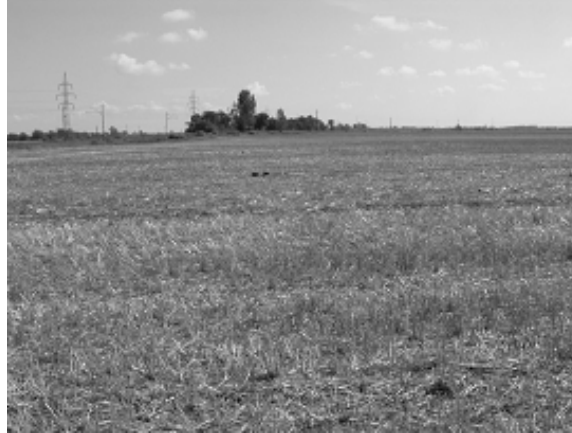
Figure 2.: Plot I-2

Previously winter barley occupied the plot, after harvesting it, the soil tillage operations were carried out as the treatments of the experiment. In the case of conventional tillage all the crop residues were baled and removed from the subplot, then millet was sown conventionally. In the reduced tillage treatments direct seeding was used but three different methods were applied regarding the fate of the crop residues: all residues remained (mulch), remaining mulch and application of a mulch tiller and pure direct seeding with no mulching.