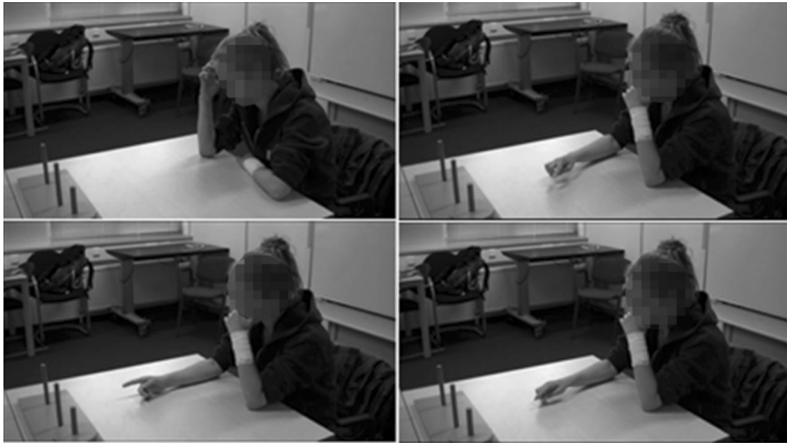
Fig. 1 Examples of spontaneous gestures arising during the mental preparation phase prior to solving the TOH

an example) with three exceptions. Two participants briefly used counting gestures, and one participant briefly used iconic gestures with two hands simulating picking up and moving all the discs. Given the practical absence of iconic gestures, as a measure of gesture frequency, we only counted the number of pointing gestures; in such a way that each rest point after a pointing gesture (either whole hand- or finger-pointing) was considered as one instance. A research assistant counted all the gestures, and the first author independently counted 10.4% of the sample to check for reliability. A high degree of reliability was found between both counts; the average intra class correlation coefficient was 0.991 with a 95% confidence interval from 0.910 to 0.996, p = .001 .