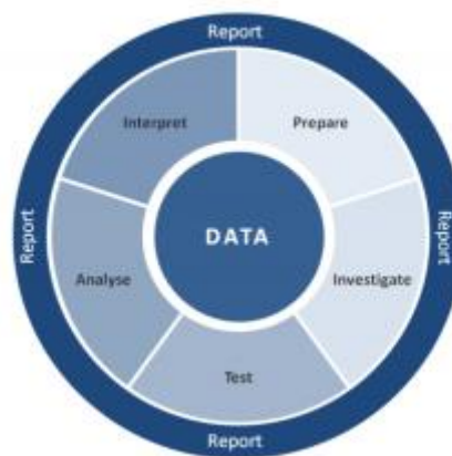
Figure 3: The data journey transformed by Child et al. [17]

Previously, the data journey believed to be flat but nowadays it should be round (as in figure 3) and ingoing which available throughout the life of project and lead to the effective interpretation of ground conditions and characterization of the site [17]. Child et al. [17] continued to explained that visualizations being generated by tools and ended in the form of a digital archive.