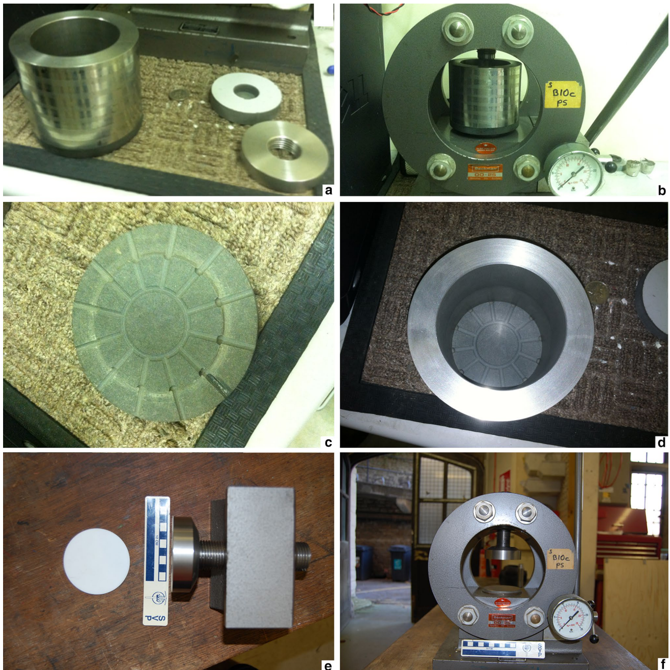
Fig. 1 Compaction rig. a–d First version. e–f Second version. a Chamber, thick Trespa disk, and stainless steel spacing ring (from left to right). b Chamber placed in hydraulic press (but without disk and ring threaded onto the frame). c Trespa base with grooves. d Cham-

ber sitting on grooved, Trespa base. e Thin PTFE disk and permanently attached stainless steel plunger threaded onto a subcomponent of main frame. f Subcomponent with permanently attached plunger bolted to the press