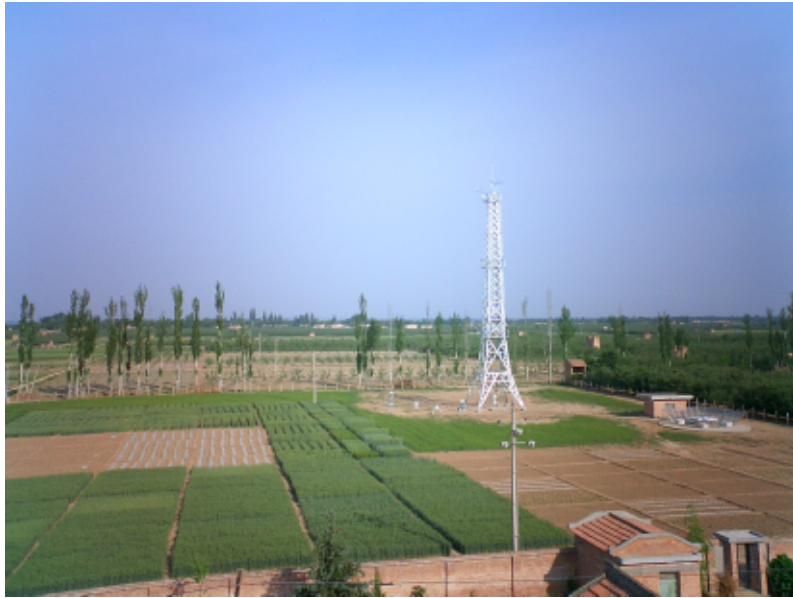
Fig. 1 The 30-m high tower established on the field of "Changwu Agro-Ecological Experimental Station".