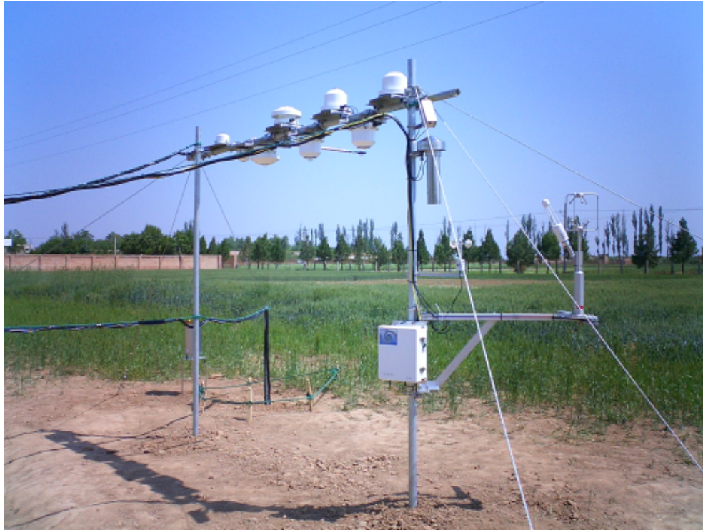
Fig. 3 The radiation measurement system installed on the ground surface. A set of ultra-sonic anemometer-thermometer and infrared H 2 O/CO 2 gas analyzer are also shown.

The ABL measurement system was (and will be) established at the meteorological field of the "Changwu Agro-Ecological Experimental Station" on Loess Plateau located at N35 ° 12', E107 ° 40'. The FROS measurements include the surface flux observations of momentum, sensible heat, latent heat (water vapor), and CO 2 . For FROS operation, we have established a 30-m high flux tower on the center of the research field (Fig.1), on which three sets of ultra-sonic anemometer-thermometers and infrared H 2 O/CO 2 gas analyzers were installed (Fig.2). Especially, fine resolution (both in time and in spectral) radiation measurement system was included as a part of FROS (Fig.3). Those installation height/depth are shown in Table 1. The data obtained from this radiation system will be used for the improvement of local surface characteristics of optical satellite measurements.