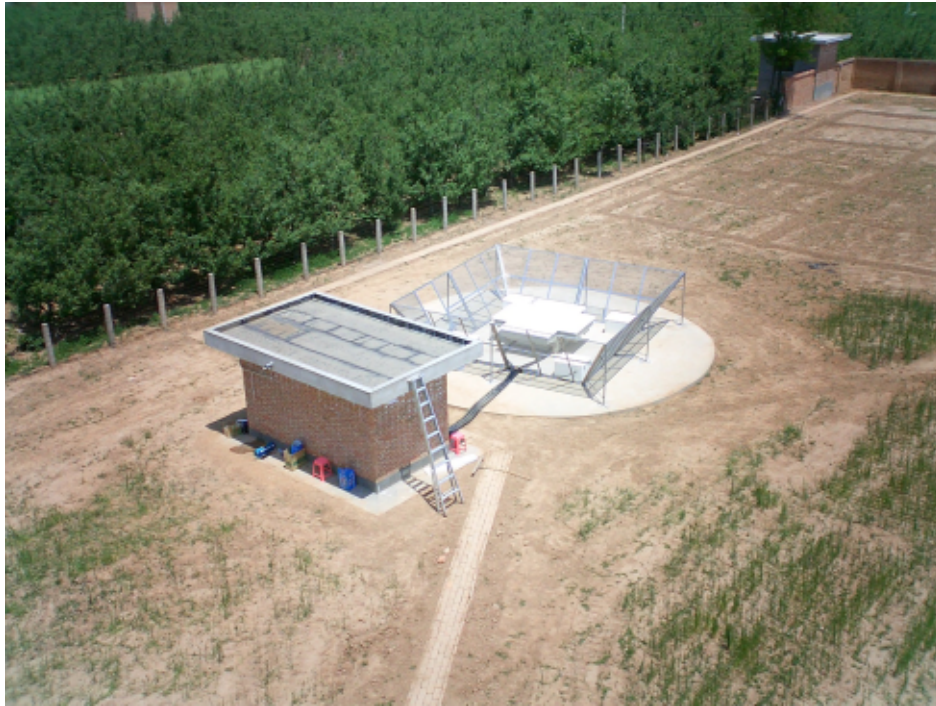
Fig. 4 Wind profiler radar (WPR) and its observation shelter.