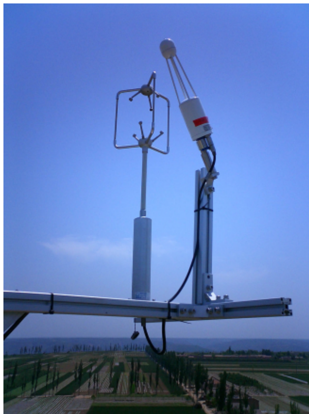
Fig. 2 A set of ultra-sonic anemometer-thermometer and infrared H 2 O/CO 2 gas analyzer installed on the tower.