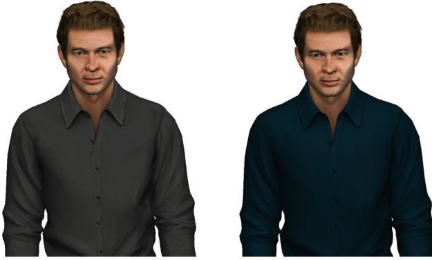
Figure 3. The visual portrayal of the two versions of the character. (left) Brian; (right) Brad.

prerequisite for making judgments about it, this participant’s data was therefore excluded from the subsequent descriptions and analyses.