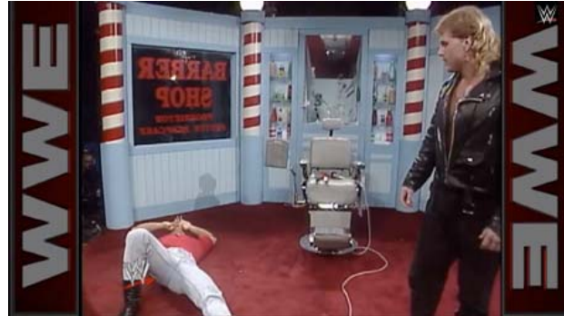
Video 2: Shawn Michaels’ “Heel turn” on Marty Jannetty. Note the repeated references to past events, and to the dramatic change in Michaels’ clothing, showing the break with the previous character and its formulae. Video from YouTube: https://www.youtube.com/watch?v=hsvUNQyWFhw eCompanion: http://journal.oraltradition.org/issues/29i/duffy#myGallery-picture(2)