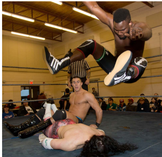
Image 2: This maneuver is a transitional move in a match, not a finisher. eCompanion: http://journal.oraltradition.org/issues/29i/duffy#myGallery-picture(4)

These examples only scratch the surface of what Parry-Lord theory can offer the study of professional wrestling narratives. The question then becomes whether the reverse is true: can studying professional wrestling further our understanding of oral poetry? A close look at professional wrestling reveals that it can.