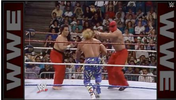
Video 1: Shawn Michaels and Marty Jannetty, wrestling together as The Rockers. Note the identical outfits and move lists, which formulaically links them together as a unit. eCompanion: http://journal.oraltradition.org/issues/29i/duffy#myGallery-picture(1)