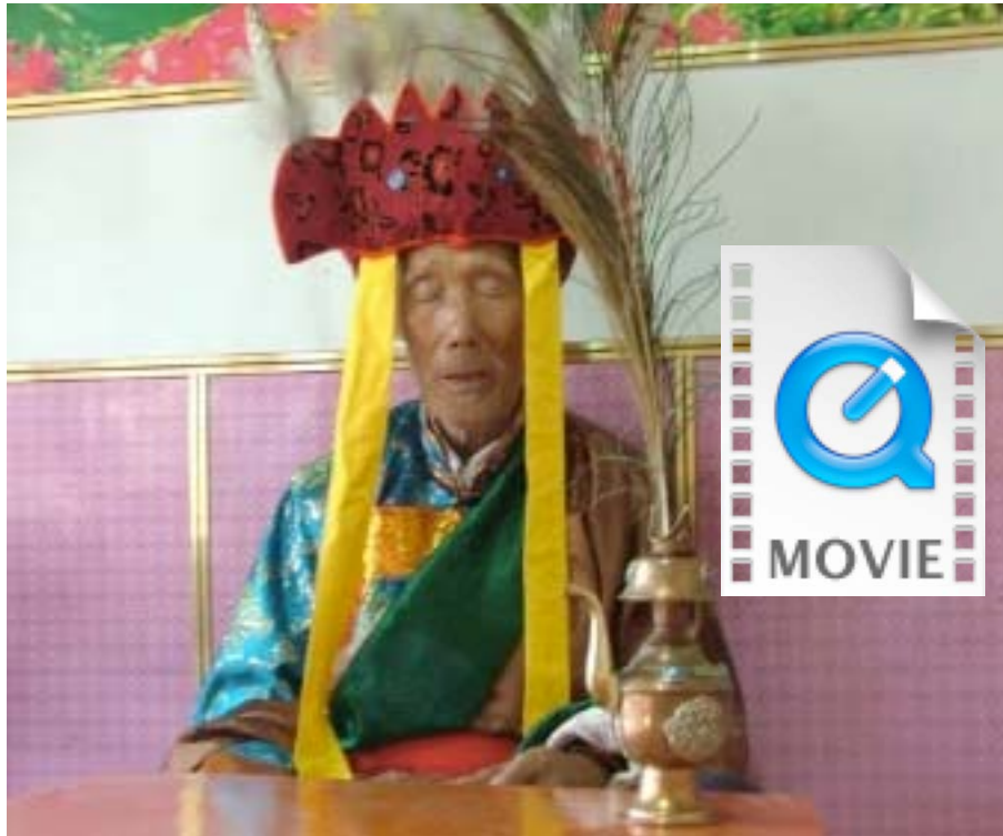
The Discovery and Protection of the Tuzu Gesar. Video by the Northwestern University for Nationalities. http://journal.oraltradition.org/issues/25ii/guoming#myGallery-picture(3)

mountain and family gods. It is believed that if the performer follows these procedures the people will not suffer any illness or disaster, and that they will also enjoy good harvests for the entire year. After all of these steps are complete, he begins his performance.