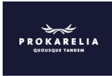
Figure: The logo of the ProKarelia movement