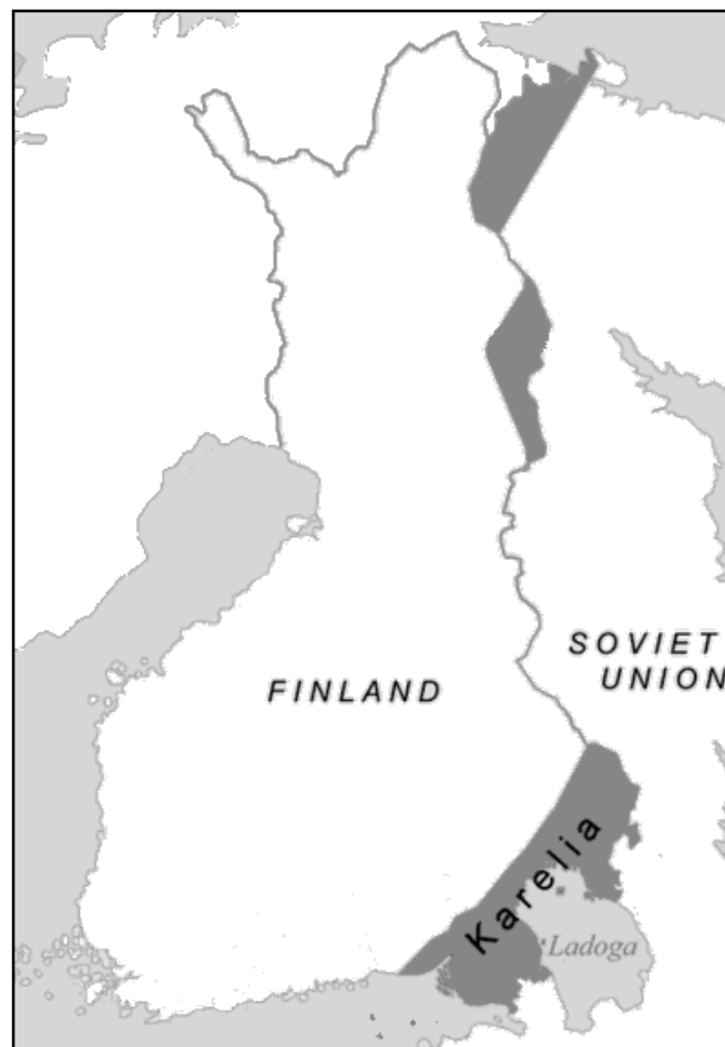
Map 3: Finnish areas ceded to Russia in 1944