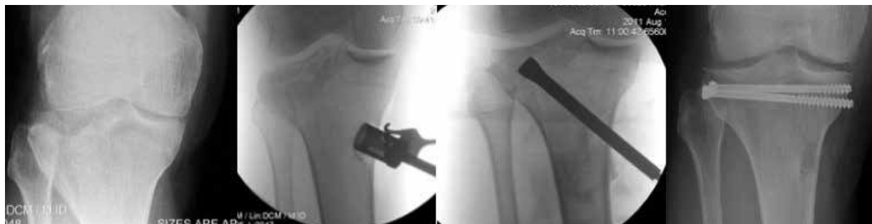
Fig. 2. Reposition of the fracture of the tibia external condyle through the trepanation window

In 16 cases, after the closed reduction of the fracture manually, a satisfactory position of the fracture of the inner condyle was achieved. In these patients, the use of plates with locking of screws, providing angular stability, located along the external surface, allowed carrying out the stable fixation of both condyles (Fig. 3). Arthroscopically assisted osteosynthesis (n=15) was used in patients with of Schatzker 2 type fracture – 4 patients. Arthroscopic