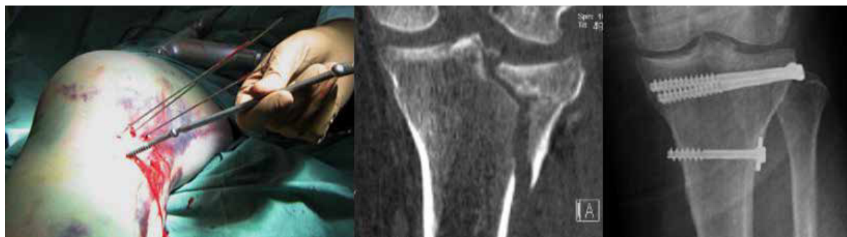
Fig. 1. The closed reposition and percutaneous fixation

the ligamentous stability of the knee joint was tested (an obligatory stage for any kind of osteosynthesis).