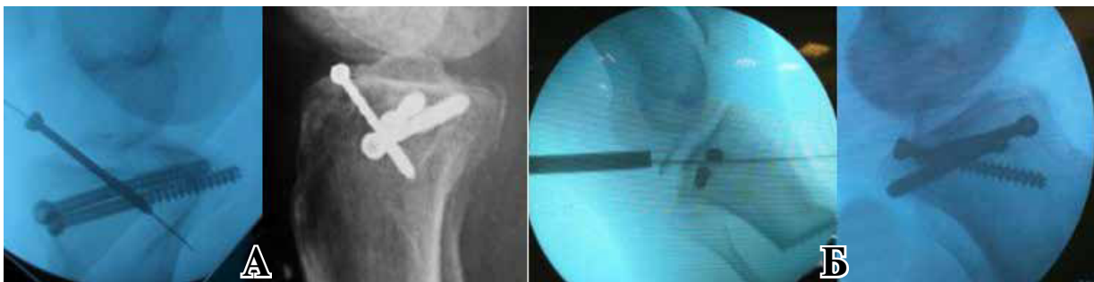
Fig. 5. Osteosynthesis of the transosseous injuries of cruciate ligaments: A – forward, B – posterior

Postoperative treatment. To reduce the edema of the operated limb and prevent vascular disorders, a leg should be in an elevated position. On the second day after the removal of the drainage, fixation of the injured limb in the hinge orthosis was made