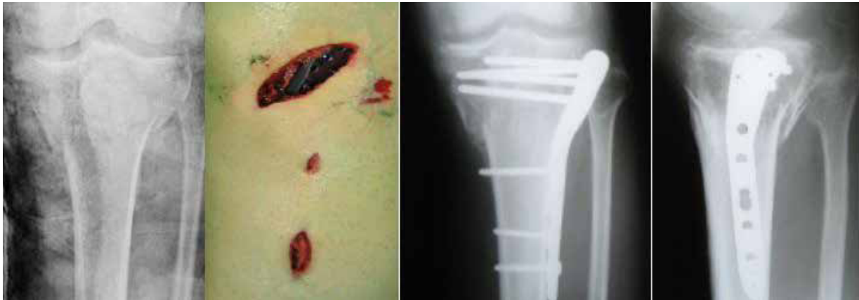
Fig. 3. Osteosynthesis of Schatzker 5 type fracture with a pre-modulated plate with locking screws