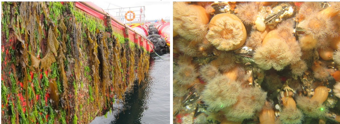
Figure 1: Biofouling community on the side (left) and underside (right) of the Pelamis P2 device. [12]

When man-made structures such as MRE devices are submerged in the sea they are colonised by a wide variety of marine organisms that form complex biological communities (see Figure 1). This marine growth, or biofouling, is unwanted from an engineering perspective as it compromises design tolerances and requires additional maintenance activities. Studies on UK marine buoys have shown that biofouling can weigh more than 33kg per square metre [5]. Det Norske Veritas (DNV) guidelines for calculating environmental loads on fixed structures predict that marine growth on oil and gas platforms can reach 132.5kg per square metre [6]. Increased structural loading caused by biofouling can often have consequences for the structural integrity, efficiency, maintenance and functioning of marine structures [7,8,9]. Artificial structures can also be colonised by non-native species [10,11,12,13], making biofouling a potential biosecurity risk and devices possible vectors for species introduction.