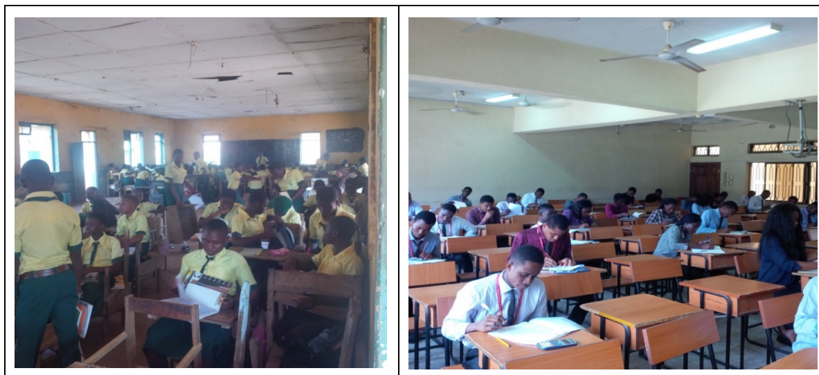
Fig. 1. (Left) and Fig.2. (Right) show two classroom environments for teaching and Learning

This work would therefore, look at how the environmental factors influence or affect students' classroom recall ability during test in a school setting in Nigeria. This challenge arose because of the observable poor facilities and poor funding currently associated with our educational system. The situation is in agreement with [7] observation that educationist in Nigeria are agreed on the need for improvement in resources (funds, manpower, etc.) available for education especially science education.