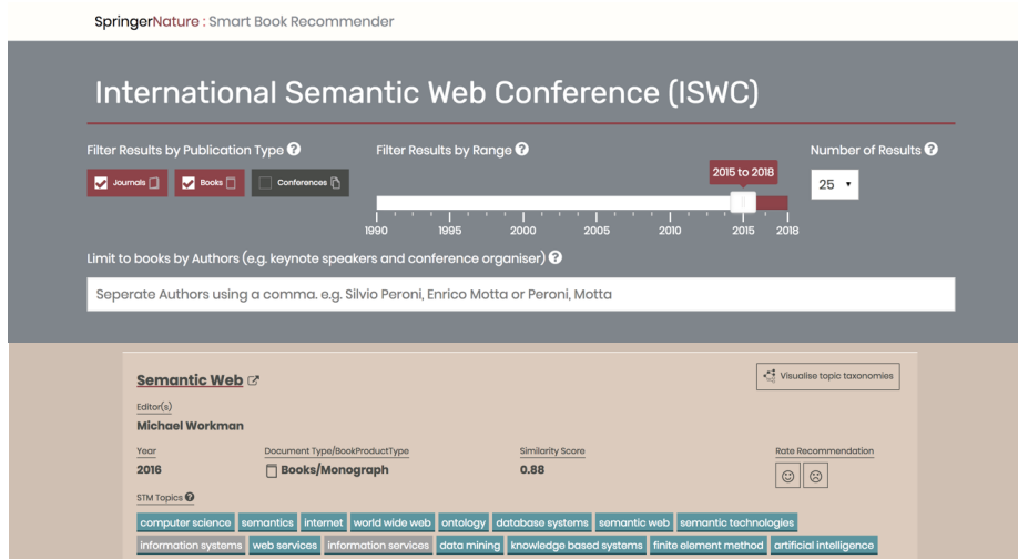
Figure 1: SBR interface showing the search tools (top) and one of the recommended items for the selected conference (bottom)

The most recent product of this collaboration is the Smart Book Recommender (SBR) [3], an ontology-based recommender system designed for suggesting books, journals, and proceedings for specific Computer Science (CS) venues. This demo paper is complementary to the one accepted in the ISWC 2018 In-Use track [3] and focuses on the main functionalities of the system. A demo of SBR is available at http://rexplore.kmi.open.ac.uk/SBR_demo/ .