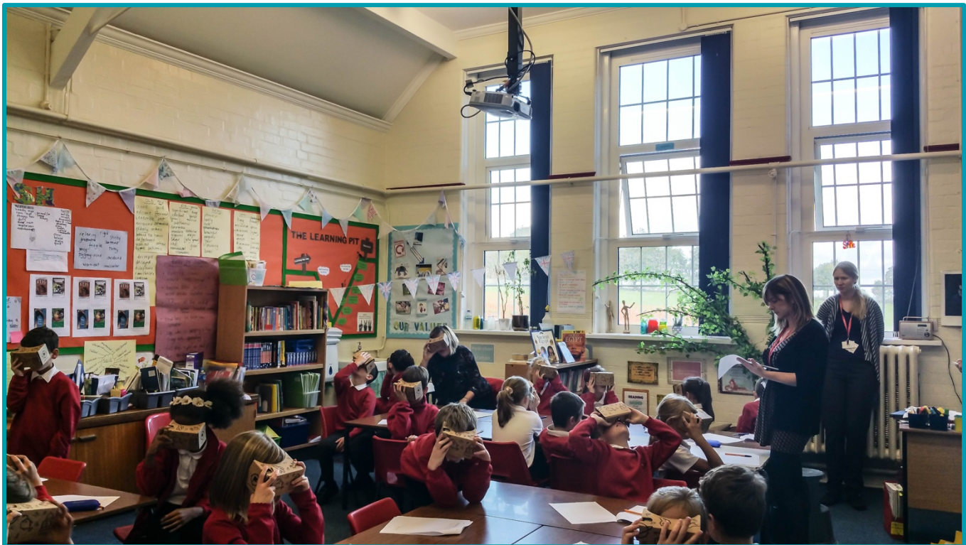
Figure 2: A Science educator in a primary school 'taking' students to a 'virtual field trip' of Egypt to look at pyramids via the Google Expeditions App