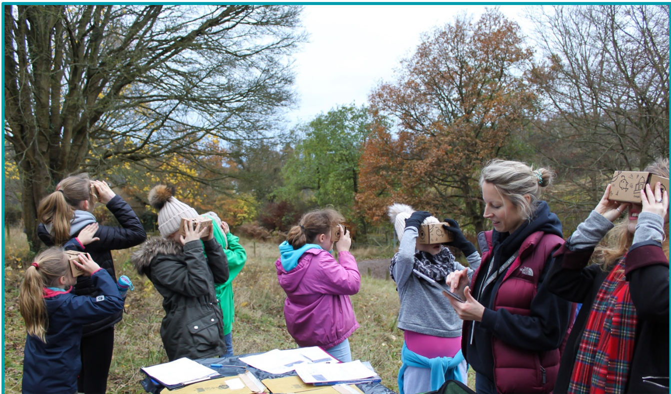
Figure 5: Students looking at the Borneo Rain Forests Expedition during a field trip to a local nature reserve

VR-based VFTs provide venues for practicing “once they’ve analyzed their (field) data they’ve realized they could have done it somewhere else. Then they could go and do it virtually somewhere else.” [Geology educator, member of the field trip team]; and applying fieldwork knowledge to other contexts: “[...] try to transfer the skills that they’ve developed in a physical field trip into... the skills they know by using them in a different setting and that different setting is a virtual one.” [Fieldworker and field sciences expert, FSC]