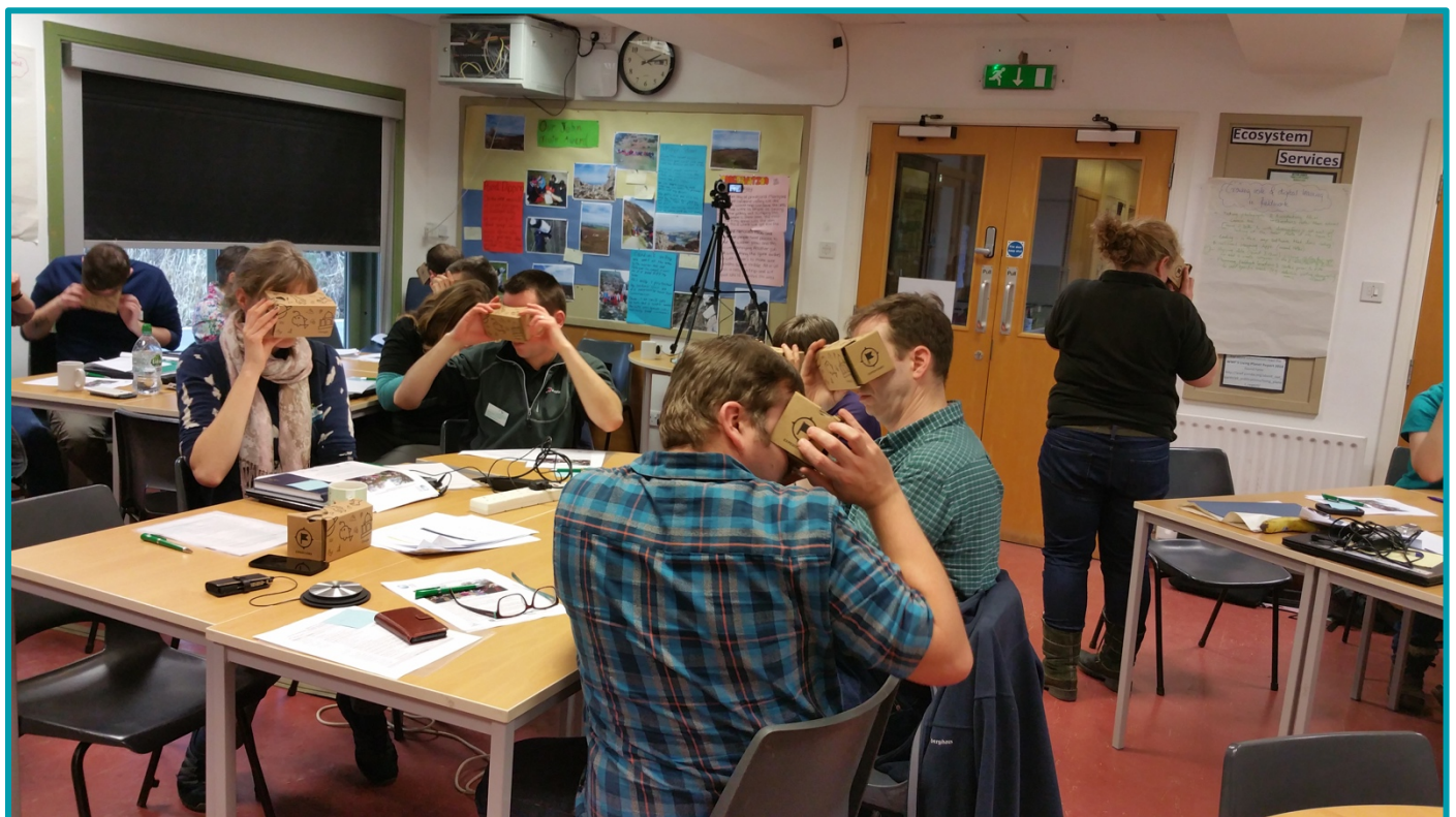
Figure 4: Workshop with fieldworkers at an FSC venue