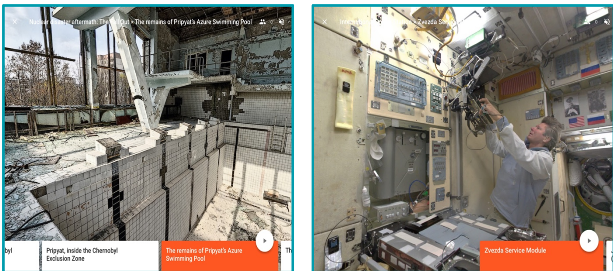
Figure 6: a) Chernobyl – nuclear disaster aftermath; and b) International Space Station

The most effective use of any form of VR (GEs or 360-degree videos or 3D avatar-based virtual environments) will be when it is combined with other technologies such as videos, podcasts, wikis, blogs, forums and mobile apps and is situated within the learning outcomes of the lesson/curriculum. The adoption of virtual reality and technologies, in general, in schools and in further and higher education is still in its infancy and its development will progress and mature as the evidence-base on the pedagogical effectiveness of these technologies grows.