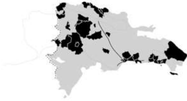
A. Municipalities sampled in PLACE 2014