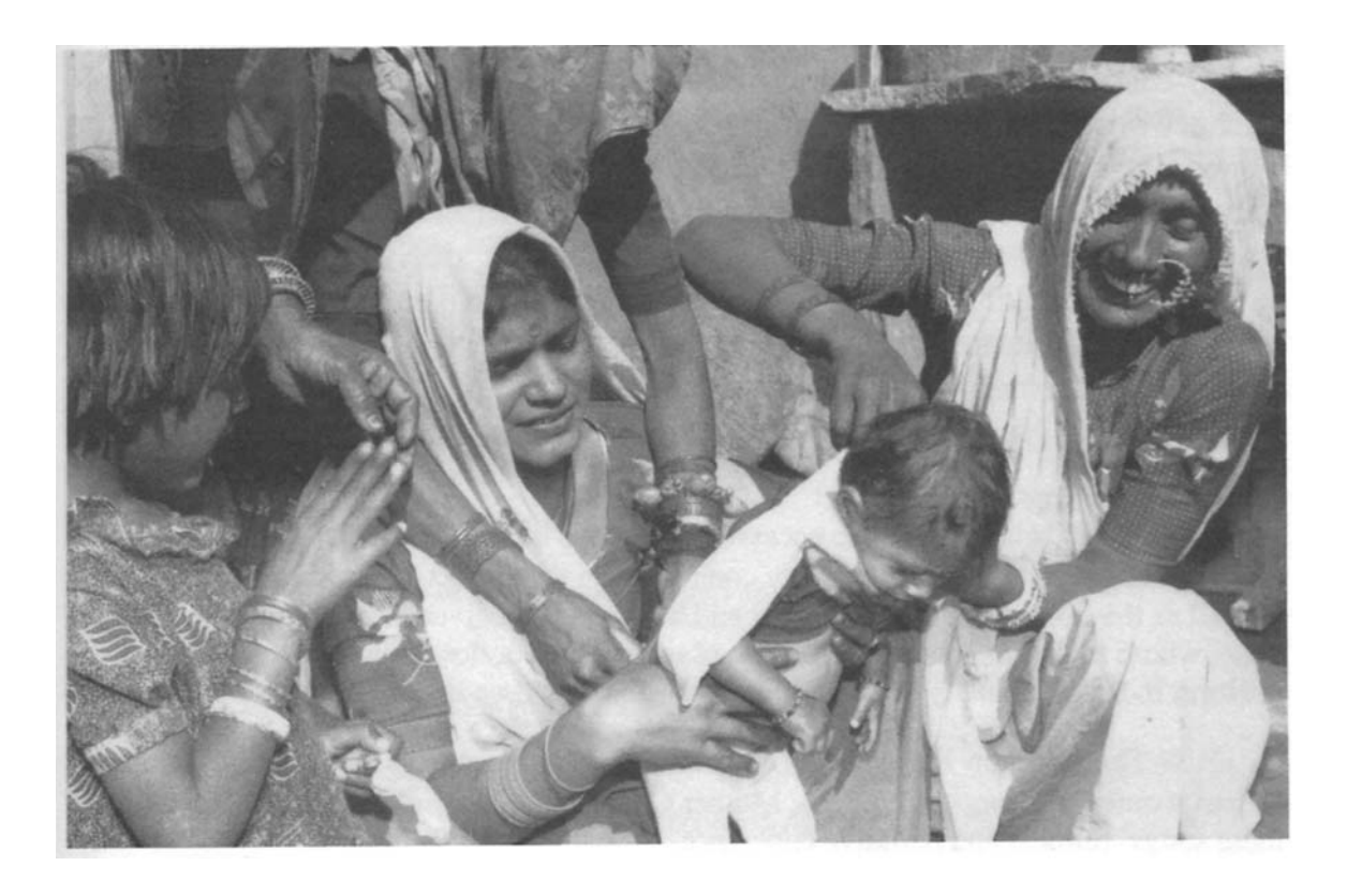
Women dress a baby boy in new clothes at a celebration ritual they perform to ensure his well-being.

The rest of this almost narrative song, which I will not cite in full detail, suggests that, the evil eye having struck, the baby becomes fretful and its eyes will not open. The power of the birthgiver is diminished, but she continues to command her husband, as her link to outside power: go and get the doctor. Thus ordered by his wife, the gallant, concerned husband brings a doctor from Udaipur city who takes the baby's pulse and prescribes a remedy; the child recovers and the yellow wrap is once more requested, along with a horse for the Barber and a flowered sari for the Barber's wife.