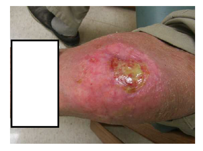
Figure 5 Left knee at 6-month follow-up.

The patient returned to our clinic again 3 months after completion of therapy with a repeat MRI showing no evidence of tumor recurrence. Incidentally, this scan demonstrated an asymptomatic, nondepressed, subchondral fracture at the inferior-lateral femoral trochlea and an anterior, weight-bearing, lateral femoral condyle fracture. On physical examination, the patient was asymptomatic with a full range of motion of the left knee.