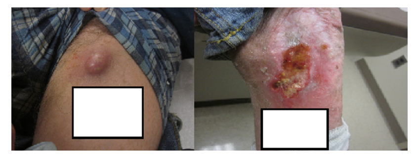
Figure 6 Left groin and left knee at 1-year follow-up.

According to the National Comprehensive Cancer Network Guidelines for Squamous Cell Skin Cancer (Version 1.2017, October 3, 2016), radiation therapy is contraindicated in patients with genetic conditions predisposing to skin cancer (including basal cell nevus syndrome and xeroderma pigmentosum) and connective tissue diseases, including scleroderma. However, this list does not include ichthyosis. Furthermore, we were unable to find any published reports on patients with ichthyosis who received radiation therapy concurrently with chemotherapy.