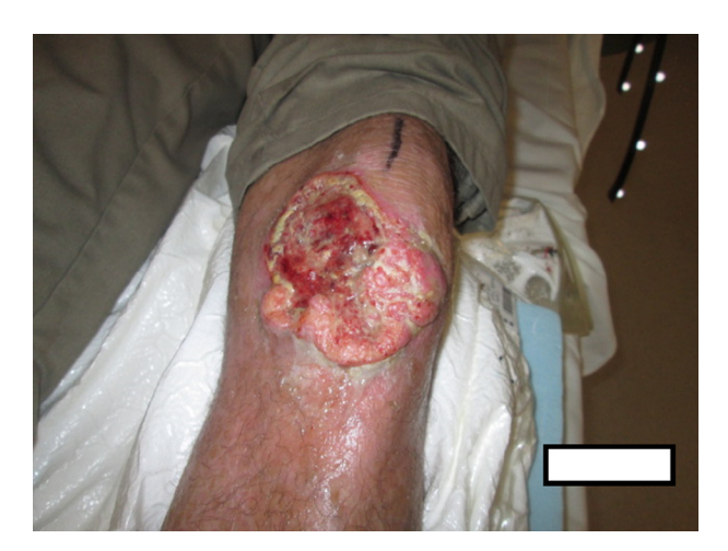
Figure 1 Left knee at presentation.

the proximal tibia and knee joint. There was no exposed bone or tendon. Neuromuscular and sensory functions in his left lower extremity were intact.