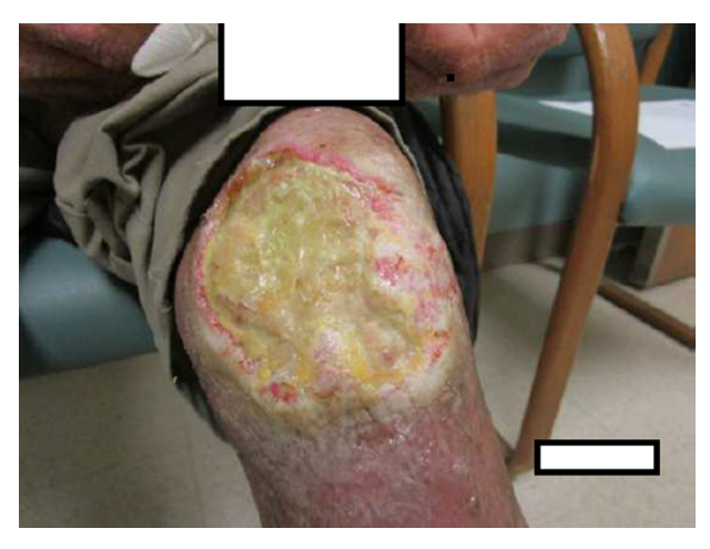
Figure 4 Left knee at 1-month follow-up.

The patient returned to our clinic 1 month after completion of treatment and demonstrated near-complete resolution of the skin erythema and desquamation (Fig 4) and near-complete resolution of the superficial knee pain.