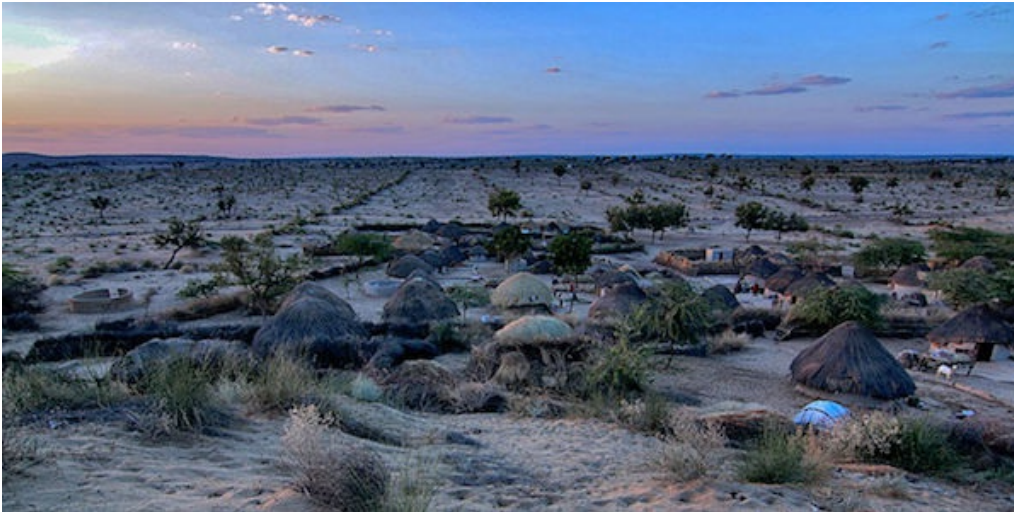
Tharparkar desert

The situation has now become more challenging for the pastoralists of this region after the discovery of coal fields in Tharparkar by the Geological Survey of Pakistan (GSP) and the United States Agency for International Development. Thar is numbered 16th amongst largest coal reserves in the world and Pakistan has emerged as one of the leading countries – seventh in the list of the top 20 countries after the discovery of huge lignite coal resources in Thar Desert; comprise around 175 billion tonnes sufficient to meet the country’s fuel requirements for centuries.