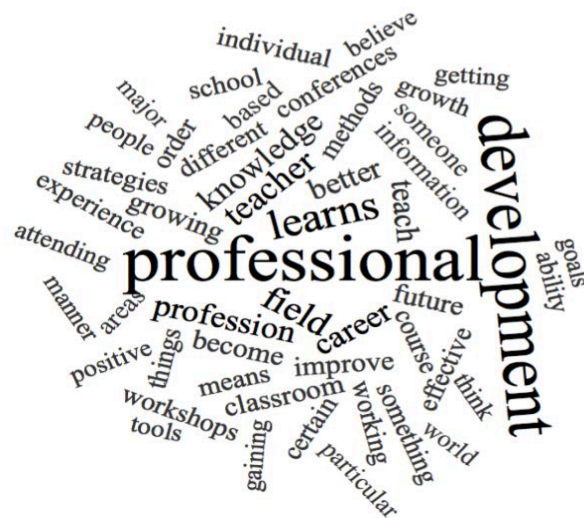
Figure 3. Word cloud of most frequently used words to describe professional development.

When asking participants ' What is professional development? ' an array of answers was given. The most frequently occurring theme revealed that 40% of participants did not have a clear understanding to what PD actually was. Examples of specific statements from participants included: " PD is how to behave on social media and what not to wear "; " Helping you to decide your major "; and " All types of students in the same classroom ". In addition, 23% of participants viewed PD as 'Useful information about various classroom aspects' and 20% of participants perceived PD as 'new tools to increase knowledge'. The remainder of answers coded was sparse in findings and included statements such as, 'making yourself [sic] better' and 'becoming and expert'. Figure 3 below depicts a word cloud generated with the most frequently occurring words from answers given.