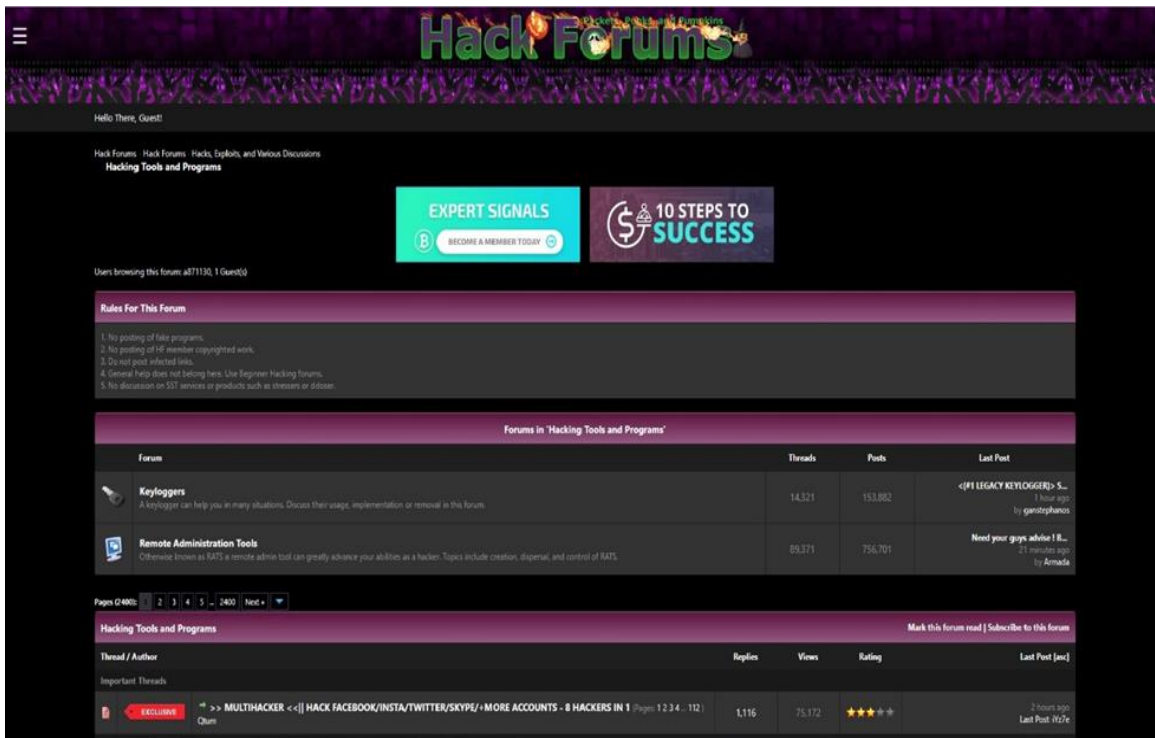
Figure 1. Forums (hackforums.net)

2. Fan pages are categorized, like forums, as places where users can post topics of conversations for others to post replies. Fan pages can be created by any individual. These pages are then hosted on a larger website alongside other fan pages of varied interests. For instance, there can be one fan page created about dogs and another fan page about hacking all on the same website. Fan page websites have their own administrators and moderators that can control any fan page. Individual fan pages can then have their own set of administrators and moderators. Finally, users of these larger sites can visit these fan pages and post onto them once they become members of that community. There are some fan pages that make entry into their community restricted. What this means is if an individual wants to read the fan page one of those fan page's that are