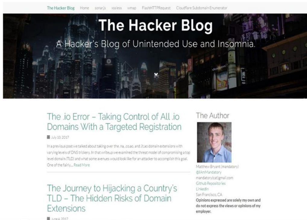
Figure 3. Static/Blog (thehackerblog.com)

article. Also, if there is a comment section, data were pulled from those interactions. In total, there were 18 blogs included in this study.