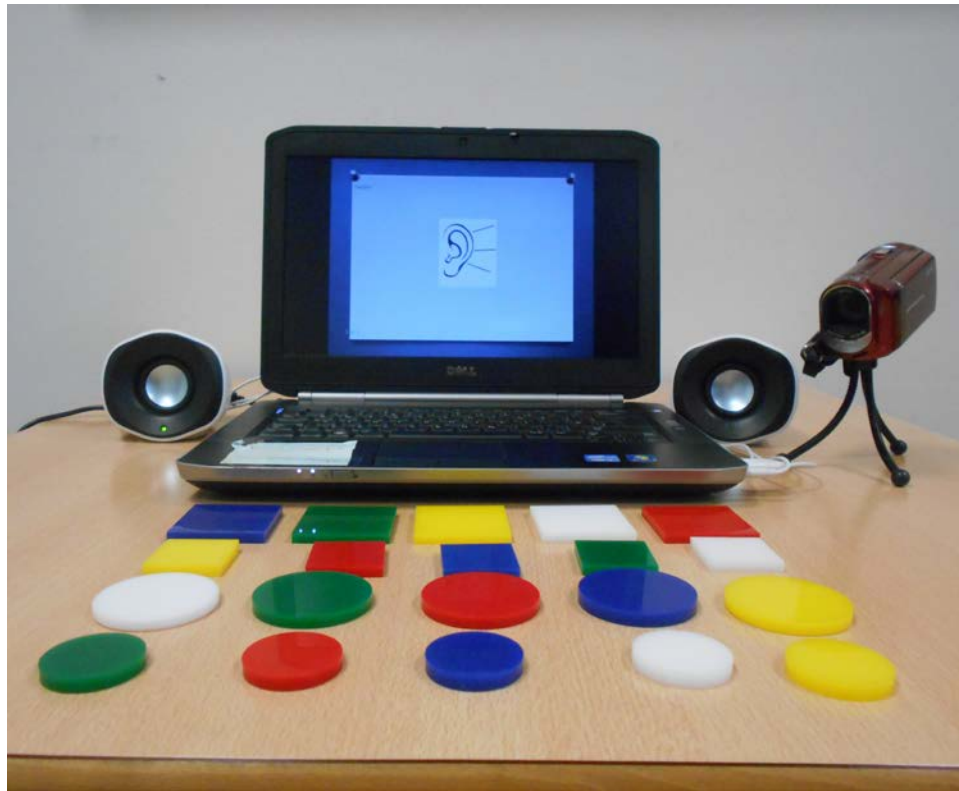
Figure 1. Image of test materials – Materials laid out for each participant to complete the sentence comprehension task.

In order to facilitate the participants' familiarization with each accent, they were exposed to a short story excerpt, adapted from Diary of a Wimpy Kid (Kinney, 2007). A short exposure period is also recommended by Nathan et al. (1998), so that the child becomes familiar with the new phonological system prior to the testing period. A story excerpt was presented in the test accent, prior to the block of instructions. Therefore in summary, participants were presented with a story excerpt, three trial instructions and 23 test instructions in accent 1; a story excerpt, three trial instructions and 23 test instructions in accent 2; and a story excerpt, three trial instructions and 23 test instructions in accent 3. The sentence comprehension task was scored using a binary scoring system. The instructions were scored in real time by the researcher. In order to check the reliability of scoring and allow off-line scoring of missed responses, a small video camera was used to record children's movement of the tokens. Three children's responses (10% of total participants) were randomly selected for re-analysis. An intra-rater reliability agreement rating of 96% was found, and an inter-rater reliability measure was obtained by an additional speech and language therapist, with an agreement rate of 94%.