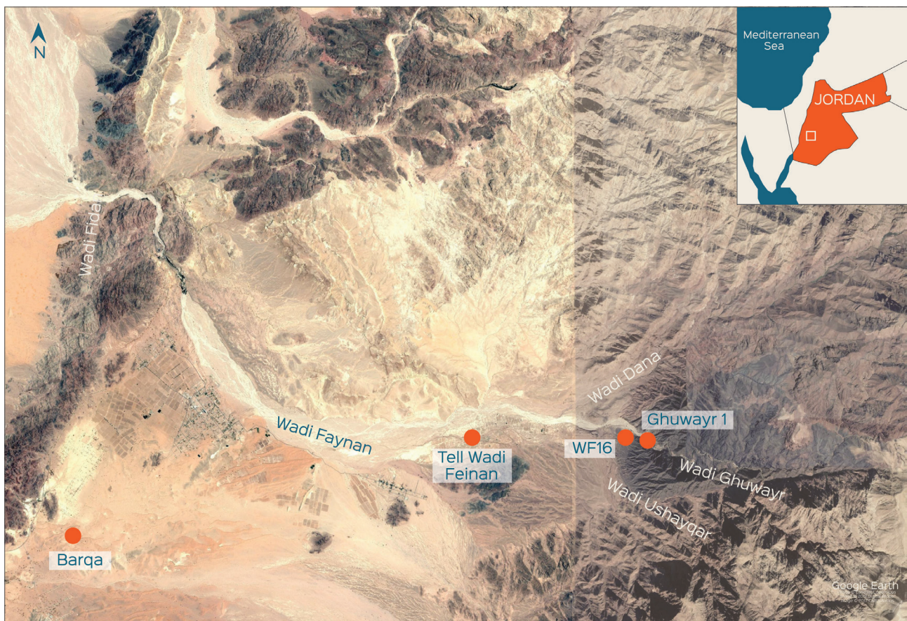
Figure 1: Map of Faynan, showing the location of Barqa, WF16, Ghwayr 1, and Tell Wadi Feinan

This sequence is illustrated in Wadi Faynan, southern Jordan (Figures 1 and 2). Within a few square kilometres one finds extensive scatters of Epi-Palaeolithic artefacts at Barqa that are likely to have accumulated over several thousand years, the PPNA site of WF16 with three phases of cultural development, involving the transition from semi-subterranean mud-plaster lined structures to free-standing circular architecture, the PPNB site of Ghuwayr 1 with two-storey rectangular buildings, and the PN site of Tell Wadi Feinan where the final levels indicate the start of copper working (Najjar et al. 1990; Simmons & Najjar 2006; Mithen et al. 2018).