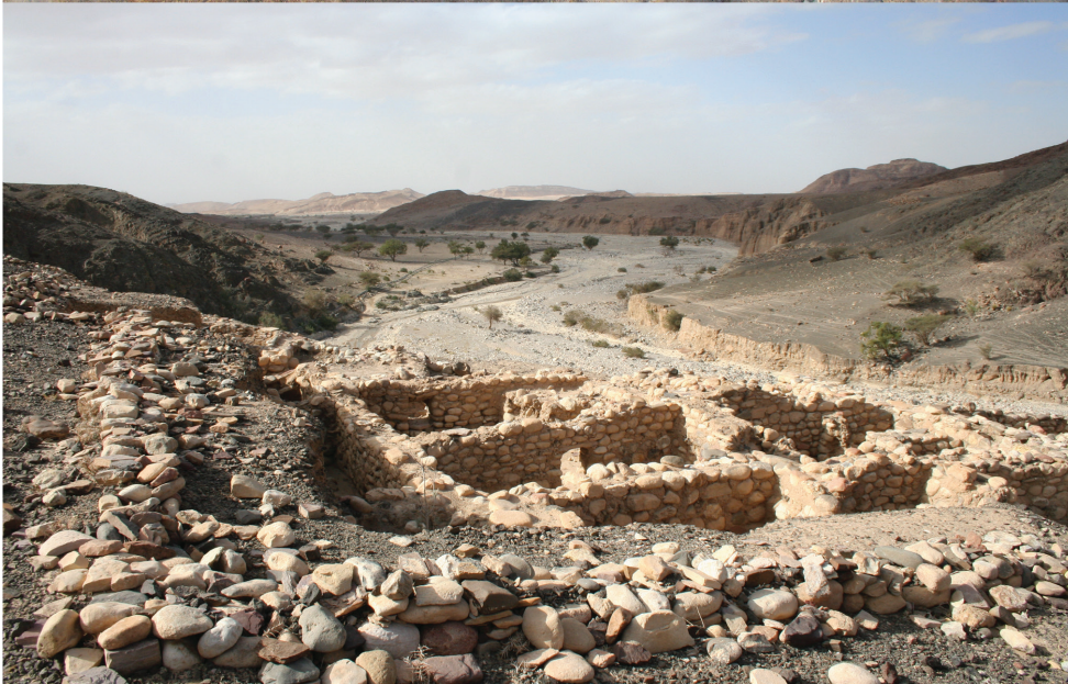
Figure 2: From top to bottom: Epi-Palaeolithic stone artefacts at Barqa; semi-subterranean mud-lined structures at WF16; Free standing rectangular architecture at Ghuwayr 1