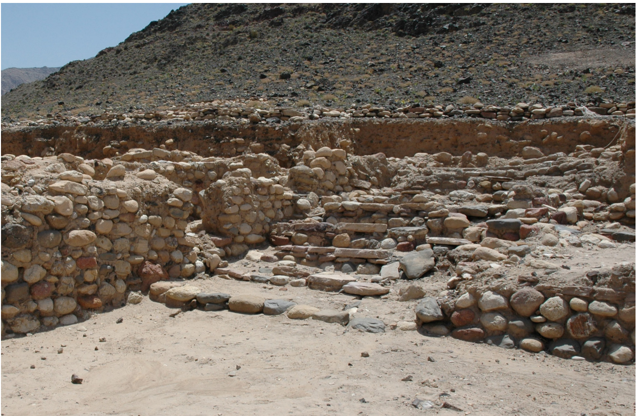
Figure 5: The PPNB ‘staircase’ at Ghuwayr 1

For a specific example, consider Figure 4 which illustrates the amphitheater-like mud-clay structure at WF16. This has a central ‘trough’, radiating ‘raised gullies’ and surrounding two-tier ‘benches’. It was constructed at c. 11,200 BP and is a unique type of structure in both design and size for the PPNA. A few centuries later, after this structure had gone out of use, a free-standing circular building with massive walls was constructed over the eastern end of this amphitheater-like structure, the earliest known for the PPNA (in the foreground of Figure 4). As evident from the former sentences, we lack suitable words to describe these architectural innovations. What words would have been invented in the PPNA? And how would the words for these two types of structure have been related to those for the mud-lined semi-subterranean structures known from the PPNA (Figure 2, middle) and preceding Epi-Palaeolithic that have strong similarities in construction methods but evidently a quite different function? One can speculate that some process of word formation was involved, perhaps compounding the word for a semi-subterranean dwelling with words for the specific activities that occurred within these new structures.