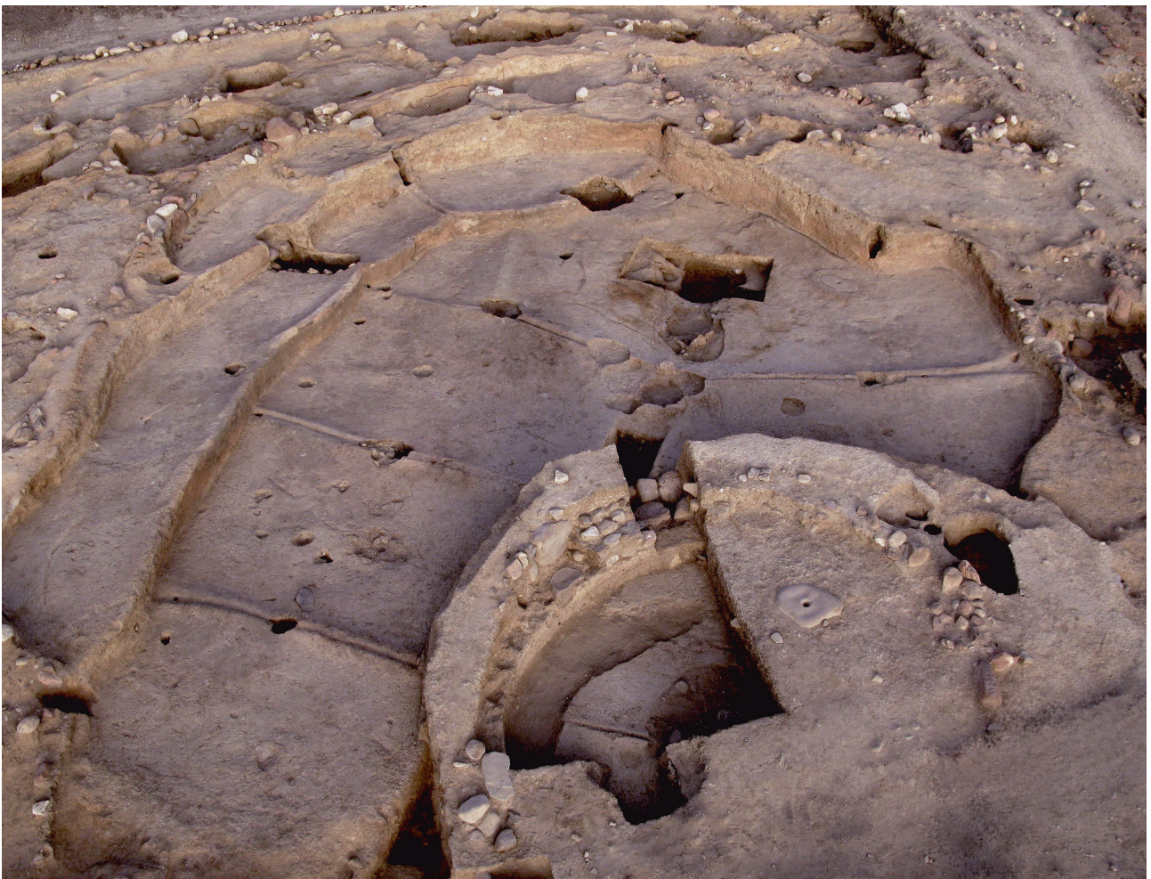
Figure 4: The amphitheater-like structure and earliest free-standing building (in the foreground) at WF16