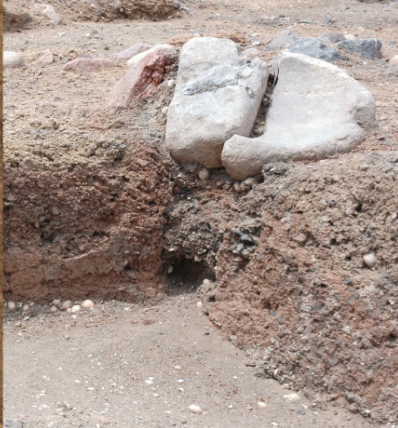
Figure 6: Top: Cup-hole mortar and associated implements at WF16; centre and bottom Stone slab and half bowl combinations at WF16