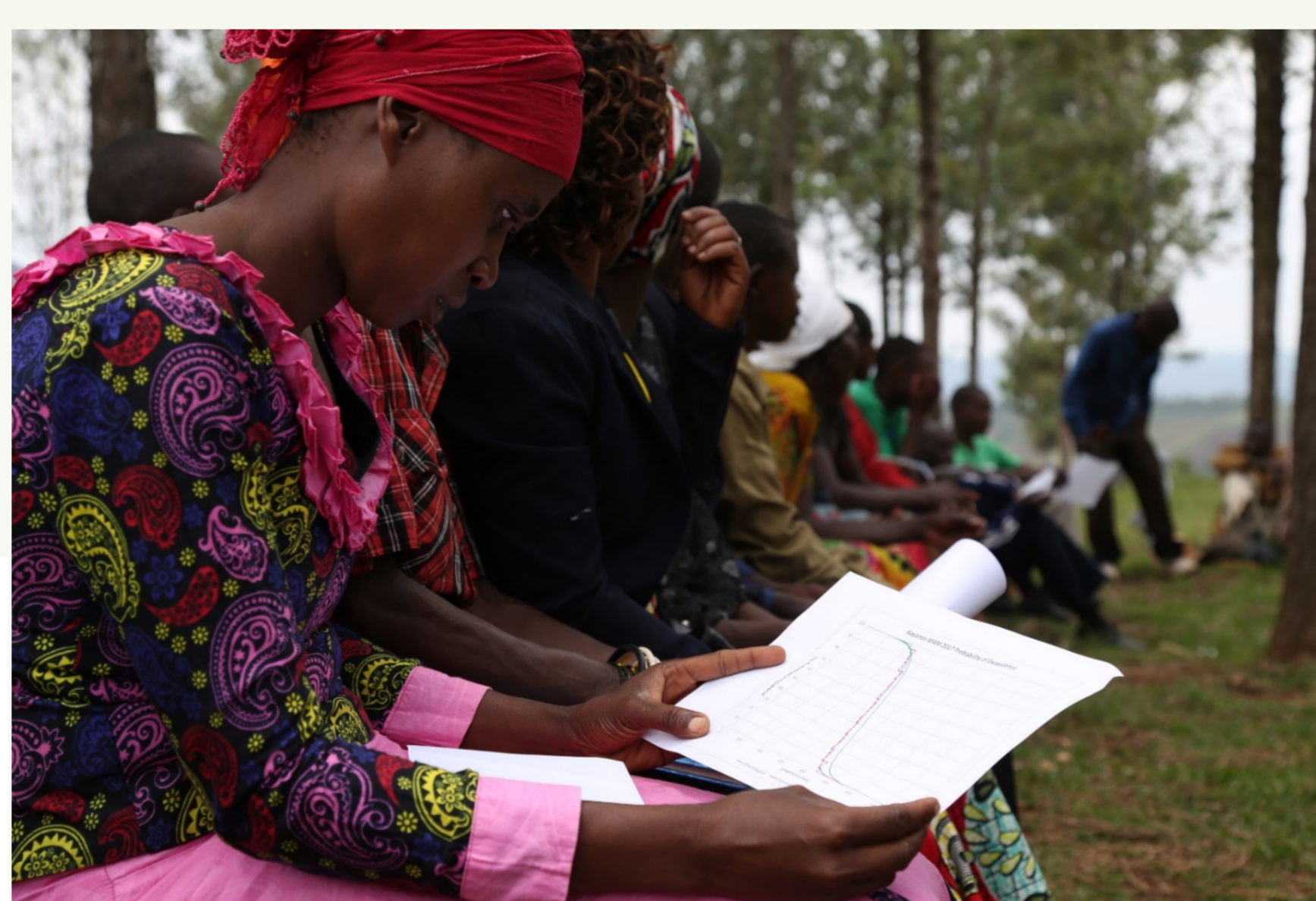
Photo 1: Farmers in Kayonza, Eastern Rwanda, discussing the seasonal forecast in probability of exceedance format

A quantitative survey was undertaken with 214 trained farmers randomly selected among 2,559 trained farmers across the four districts. The survey was carried out in March 2017 using Open Data Kit5 software.