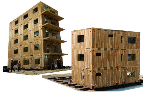
Figure 1. Two types of CLT construction methods.

Toward establishment of sustainable society, the higher engineered technique for wooden buildings of low environmental impact has been attracted attention such as Cross-laminated timber (CLT), which can effectively utilize low-quality wood materials and enables to compose a reasonable wall structure. Due to progress of research on materials and construction methods, it has become possible to design those CLT buildings by general methods in recent years.