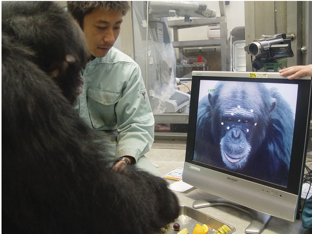
Figure 1. Experimental set-up. A male chimpanzee faces a monitor. Stickers are placed on his face and head.

In step 2, one of the following eight videos (conditions 1–8) was presented for 2 min: a live video (condition 1), a 1 s delayed video (condition 2), a 2 s delayed video (condition 3), a 4 s delayed video (condition 4), a video of the subject that was filmed more than one week prior in which stickers had been placed on the face and head of the subject (condition 5), a video of the subject that was filmed more than one week prior, in which no stickers were present on the face and head (condition 6), a video of a human who had stickers placed on the face and head (condition 7) or a video of a human with no stickers (condition 8). In steps 1 and 2, an experimenter gave a small piece of food about every 20 s to ensure that the chimpanzee remained in a relaxed state to enable recording of their behaviour, regardless of the chimpanzee's behaviour during the test.