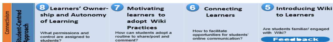
Figure 3: Establishing social interaction phase in the gameboard: Block 5 – Block 8

At this phase, students experience using and interacting with Wiki in Block 5 and going through a feedback checkpoint. At this point, students' voices reflect their initial feedback about the proposed framework to confirm their perception, understanding and interaction with their Wiki without barriers.