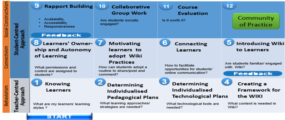
Figure 1: Gameboard of a metaphoric game for online course design

The gameboard (framework) illuminates three phases: (1) planning; (2) establishing social interaction and (3) sustaining social community. Throughout the game and before starting each phase, there is a student feedback checkpoint and the tutor has the choice to add more checkpoints, if needed. There are two reasons behind these checkpoints. Firstly, to assure the principal of shared responsibility and collaboration between the members of online community (students and tutors), as according to Troisi (2014), student feedback opens the opportunity for more frequent feedback and shared responsibility for course success. In addition, it facilitates course tutors to be more iterative, dynamic and to fit the needs of their students. For Kim (2006), different feedback checkpoints in the online learning environment reflect a successful community building. In details, it is essential in the planning and designing of online course to reflect the student' needs, views and suggestions. Secondly, numerous feedback checkpoints and responding to them, add the feature of flexibility to the gameboard, as the outcome of a checkpoint can be "snake" where the tutor may find that leaping back is a requirement to work on an area of improvement or "Ladder" to move forward and achieve progress. The following section details the three phases of the framework.