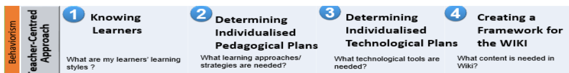
Figure 2: Planning phase in the gameboard: Block 1 – Block4

The framework starts after the determining the course aims and objectives by tutors and/or course administrators. The first step ( Block1 ) in the framework starts by knowing learners through many methods (i.e. one-to-one interview, VARK online test (Fleming, 2006)). According to Turner-Bisset (2001), the objective of knowing learners is that tutors will be able to contextualise the knowledge of learning theories and how a particular group of learners would respond and behave. Another pedagogical benefit for knowing learners that it enables tutors to present their lessons in a manner that suits all learning styles, learners' needs and preferences (Skvorak, 2013). The player (tutor) proceeds to the next two blocks; Block 2 determines the pedagogical plans and Block 3 determines technological plans that suit the different learning needs and pedagogical plans that have been identified in Block1 and Block 2 respectively. Referring to the design of online learning community, Kim (2006) addressed that, investing too heavily in a technological and educational platform that can't be easily changed or updated, is one of the most common mistakes in designing the online