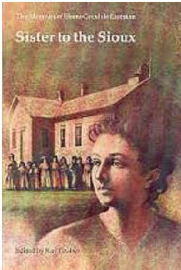
Figure 3: Sister to the Sioux front cover

The U.S. territorial imperatives that thrust Jim Miller's ancestors further west were the same territorial imperatives that allowed Elaine Goodale Eastman to pursue a dream of pioneering adventure in the Dakotas from 1885-1890. Sister to the Sioux: the Memoirs of Elaine Goodale Eastman features a grainy front-cover illustration of the author's head and upper torso foregrounded and turned in semi-profile. Thick, light brown hair is piled in a loose bun and curls ring the face of a white woman with the