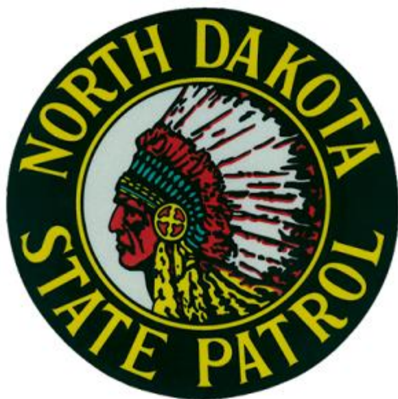
Figure 4: Long-time patrol logo for North Dakota State Police. Officers from this department would have deployed to Standing Rock to arrest water protectors.

The lengthy paragraph above waxes poetically and ostentatiously to describe the land as