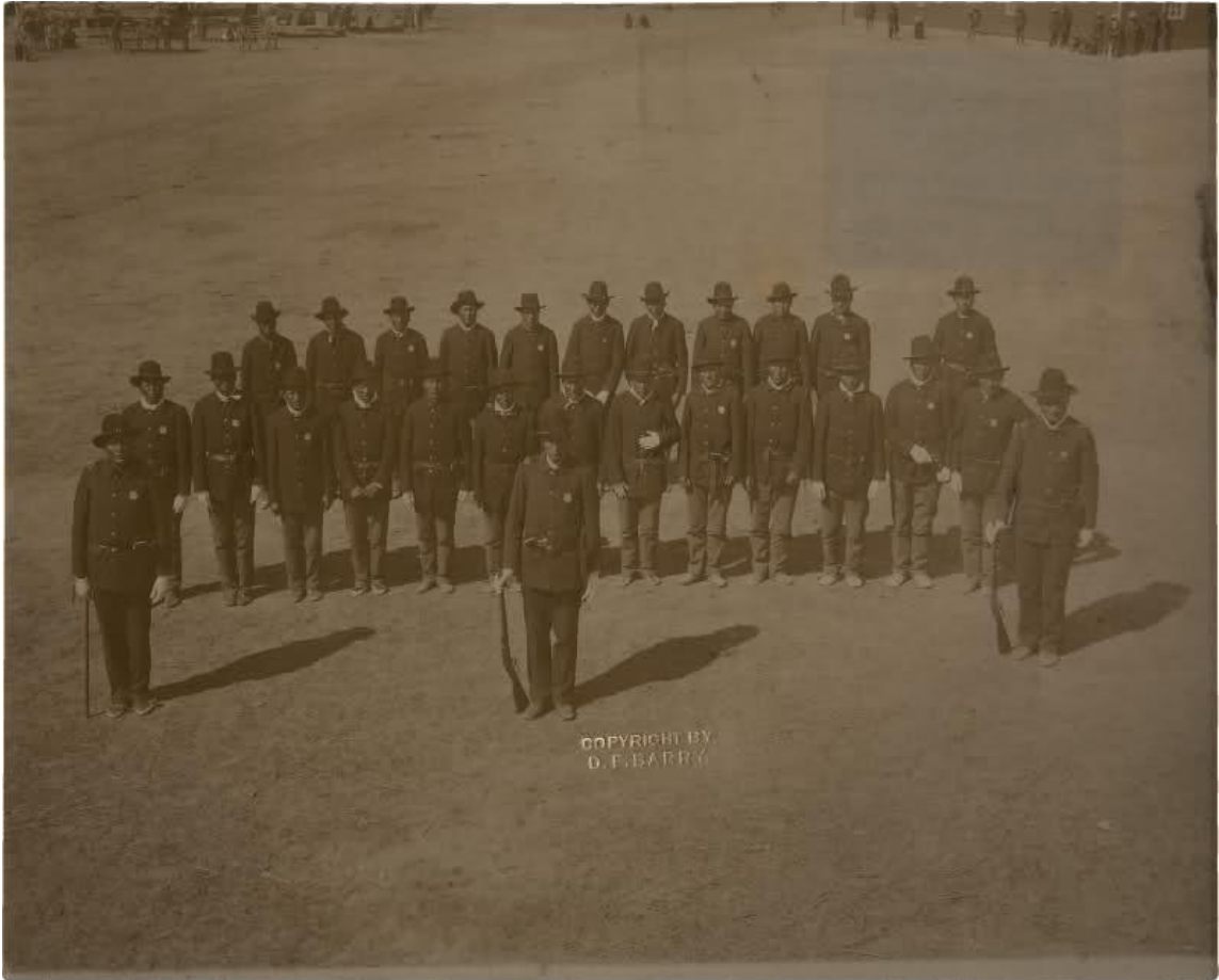
Figure 1: Standing Rock BIA Police force in 1890

In her memoirs of her five years in Lakota territory, Elaine Goodale Eastman writes that the Standing Rock Indian agent, James McLaughlin, believed Thǎthǎjka Íyothake to be a “troublemaker” due to his involvement with the Ghost Dance, and gave orders for his arrest. McLaughlin believed lifetime imprisonment for Sitting Bull’s rebellious outbreak represented a punishment greater than death. 52 In this exchange, complex realms of settler affectivity emerge as the white aspirational ability to enact arbitrary racialized, gendered violence and carceral punishments due to a feeling, the infusion of affect: a troublemaker in our midst, students relapsing into known customs, “danger, war and outbreak” looming close on the horizon. 53