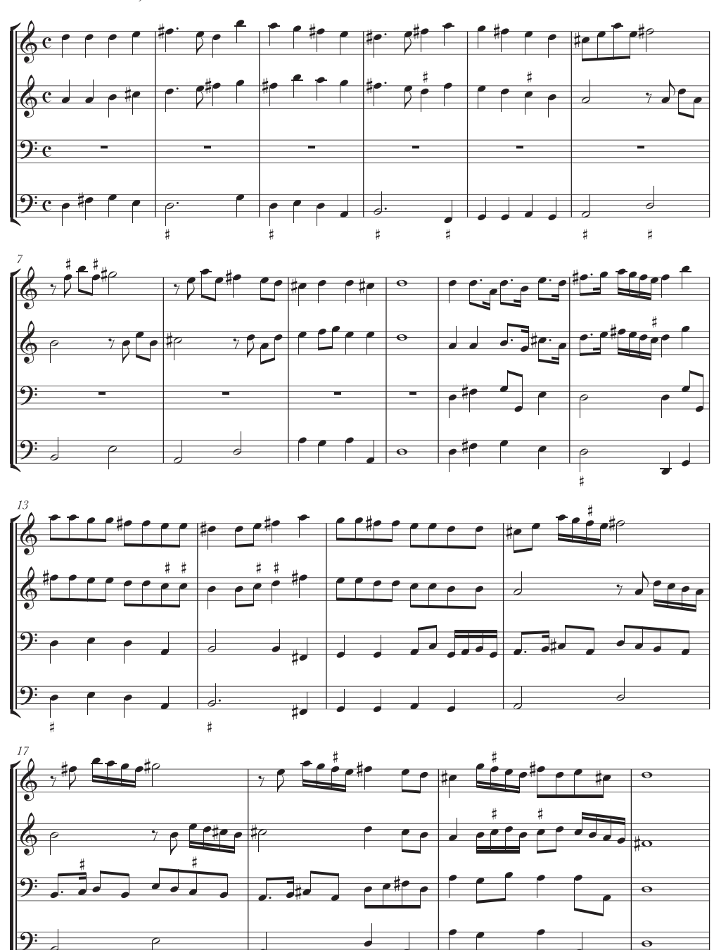
Ex. 4. 'Il Zontino', bb. 1-20