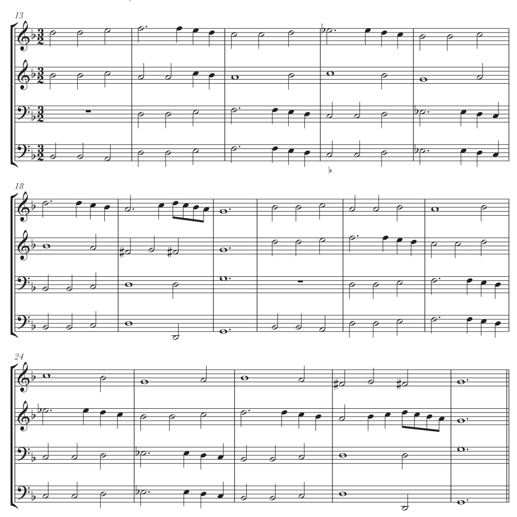
Ex. 6. 'Il Vendramino', bb. 13-28

the melody. In this case, the surprise appearance of a familiar tune at the end of the work would surely have caused a stir among Marini's listeners, as they marvelled at and discussed his prowess as a composer, simultaneously renewing their affections for the person or family at the centre of his composition.