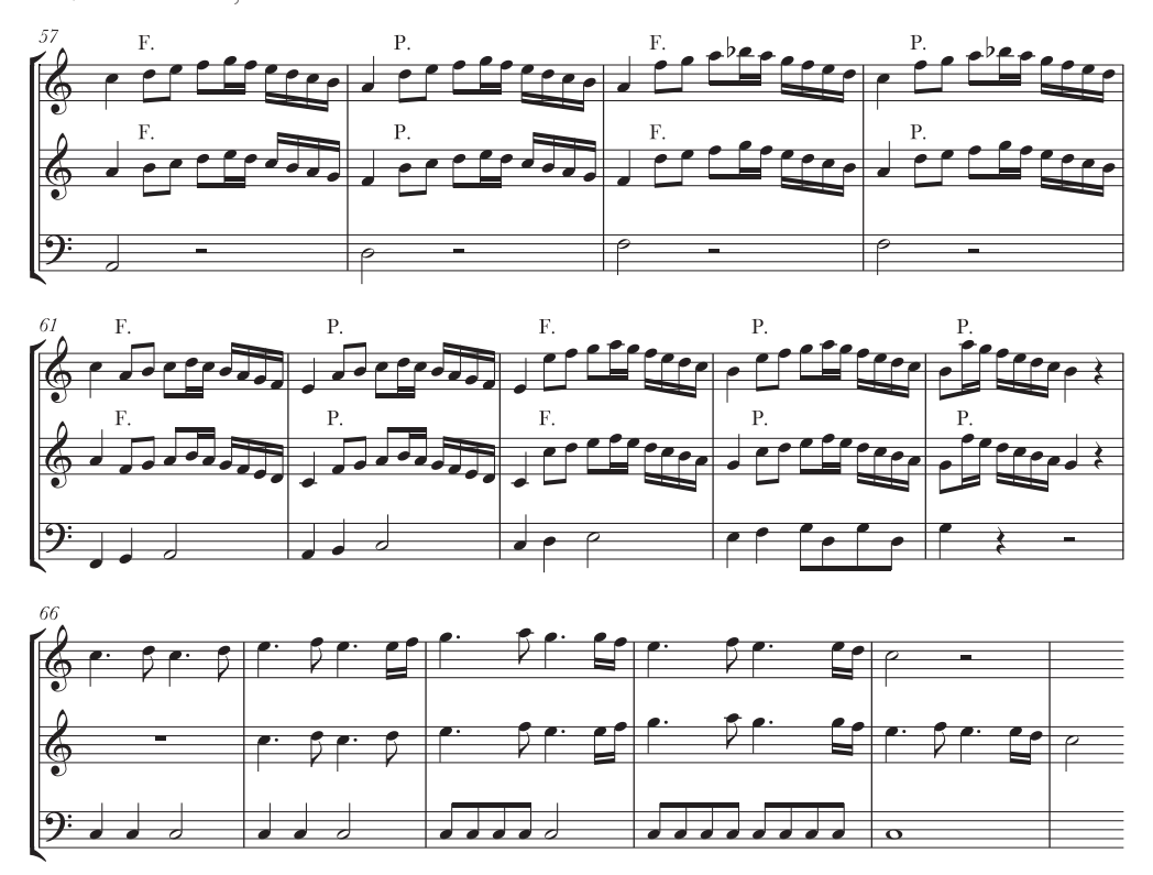
Ex. 2. 'La Bemba', bb. 57-71

A third example is 'La Martinenga', a piece composed almost entirely of canons, although Marini juxtaposes that austere, rigid technique with an intense communication of pathos in melodic and harmonic gestures. The melodic material centres around cascading scalic figures in A minor. In the first section the canon occurs at the unison after one bar (see Ex. 3(a)). Elsewhere, however, Marini alters it. At bar 15, for example, he intensifies the effect of the canon by quickening the imitation: here, although the melody is based on the same descending pattern, the canon occurs at the unison after only a single crotchet (see Ex. 3(b)). Through the use of such affective musical gestures, an essential quality in much of the instrumental stile moderno , Marini seems to update the canon, affirming the possibility that such a formal technique may have a place in the new instrumental genres.