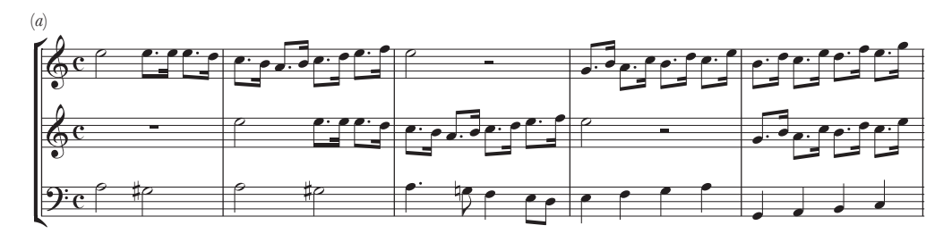
Ex. 3. 'La Martinenga': (a) bb. 1-5; (b) bb. 15-19