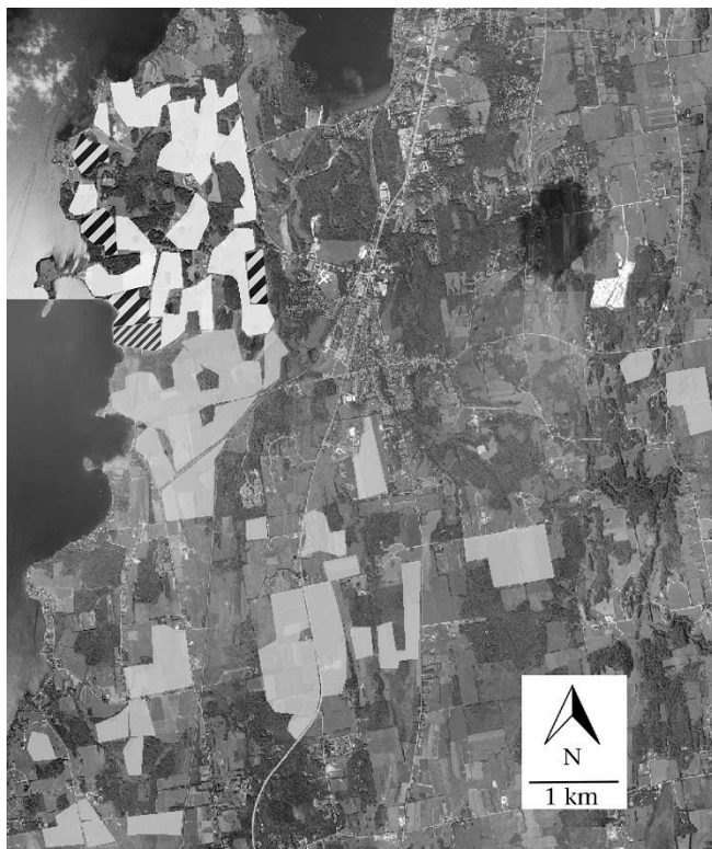
Figure 1. Study area at Shelburne, VT, U.S.A. The landscape is a mix of forest, agricultural fields and human development. Grasslands and row crop are indistinguishable from aerial images, and the majority of open areas within this landscape were identified on the ground as row crop. Areas covered by diagonal lines are the five focal fields where demographic information on bobolinks and Savannah sparrows was collected. We searched for banded birds in the white-covered areas during 2005–2014, and grey-covered areas during 2014.

May and 11 June, and hayed again in early to mid-July; (2) middle-hayed (MH): hayed between 21 June and 10 July; (3) late-hayed (LH): hayed after 1 August; (4) gap-hayed (GH): first hayed before 31 May and again at least 65 days later; (5) rotationally grazed pastures (RG): fields in which cows were rotated through a matrix of paddocks with multiple week 'rests' between grazing events (for further details, see Perlut et al., 2011, Perlut et al., 2006). Our five main study fields, where bird demographic data were collected, ranged in size from 16.3 to 19 ha. Other fields within the landscape ranged from 1.9 to 40.4 ha. Grasslands were irregularly spread throughout the landscape; individual grassland fields were rarely adjacent to other agricultural fields (grassland and/or row crop) on all sides, most often adjacent to other agricultural fields on one to two sides, and sometimes completely isolated from other agricultural fields by forest or human development (Fig. 1).