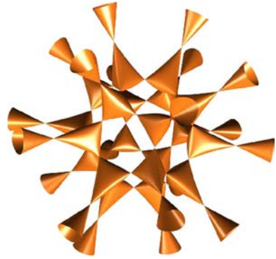
Fig. 1 Barth’s sextic surface