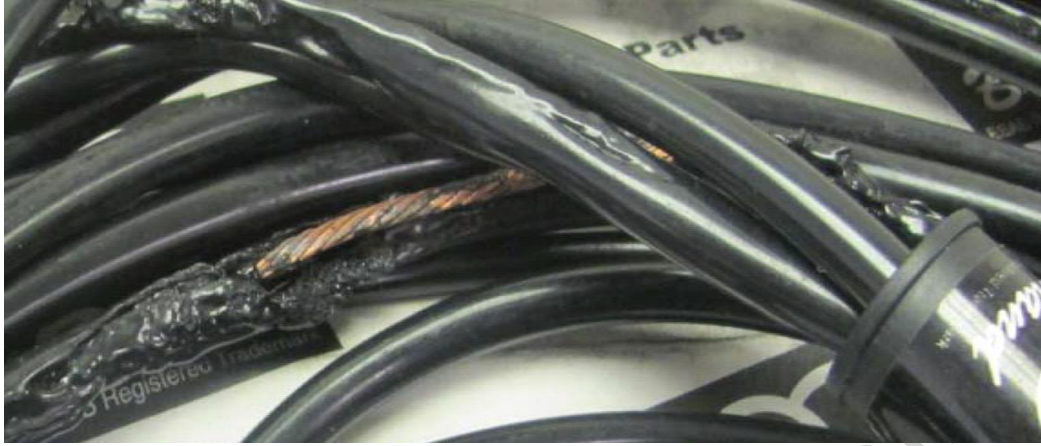
Figure 2. Melted insulation on welding cable.