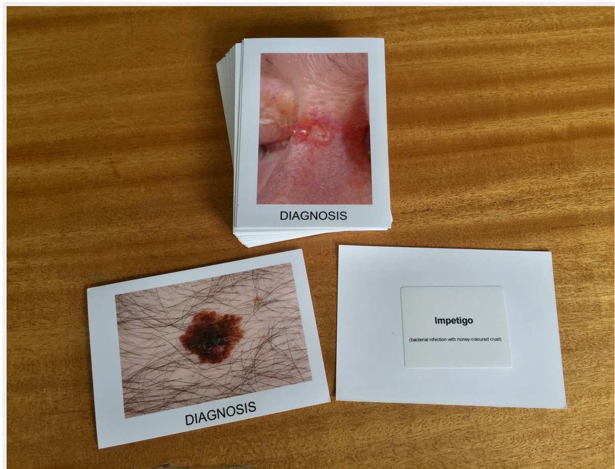
Figure 1. Image of dermatology flash cards with image on one side and correct diagnosis on the other

Subjects were briefed in how to use the SAFMEDS flashcards (Haughton, 1980). They had to read the question on the top side of the flashcard and attempt to provide the correct answer provided on the reverse of the flashcard as quickly as possible, for one minute in each trial (Figure 2).