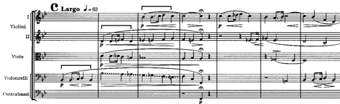
Fig. 1. Beginning of Variations in B flat major on 'La ci darem la mano' by Mozart, Op. 2 (1827 - 28)

Moving on to Sonata Op. 4 (Fig. 2-1), the theme appears to be taken from Bach's Invention no. 2 in C minor (BWV 773) (Fig. 2-2), and although incomplete, the theme is imitated in the bass in bar 2. As in the Variations , we also find a lament bass from the second half of bar 2. The layering of the lament bass with the imitative counterpoint appears to be a defining characteristic of Chopin's imitative counterpoint in the early period, which he used emphatically right at the beginning of large-scale works.