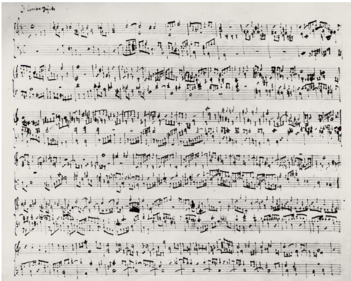
Fig. 6 Chopin's copy of Ex. 220 by Cherubini Chromatic Fugue in Four Parts, with Two Counter-subjects . (TiFC F. 1677-4)

Between the two, Chopin appears to have studied Cherubini more closely, going so far as to copy out Cherubini's examples. 7 Chopin's copy is not a mechanical duplicate of the original that was set in open score; Chopin rescored them in the grand staff. Among these are Example 220, which features the chromatic subject (Fig. 6). From these one may infer what kinds of knowledge Chopin could have gained in the process, ranging from the inner workings of fugues to the use of chromatic motifs.