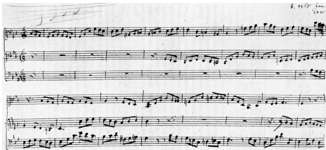
Fig. 15. Felix Mendelssohn Bartholdy: Exercise book, fol. 67v (Todd: 67)

this point. Indeed, D minor suits the cello better than C# minor for producing richer sound. Naturally, Chopin must have considered it and designed such a tonal scheme.