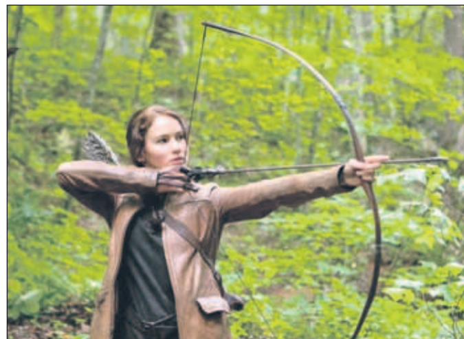
Jennifer Lawrence steals the show in The Hunger Games

The film is bold, brave and often quite terrifying. The perfect blend of action and emotion. This is powerful stuff that will linger on in your thoughts for a while after it's over. It remains to be seen if the sequels will match up to this impressive first helping...but on this showing, it's looking good.