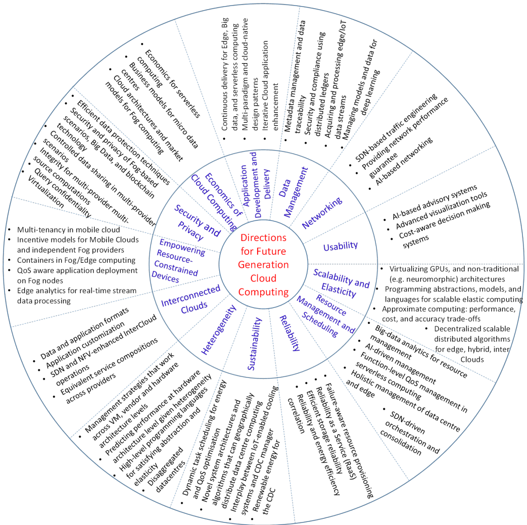
Fig. 3. Future research directions in the Cloud computing horizon

computational tasks such as CPU, memory and storage, will be built as stand-alone resource blades, which will allow faster and ideal resource provisioning to satisfy different QoS requirements of Cloud based applications. The future research directions proposed for addressing the scalability, resource management and scheduling, heterogeneity, interconnected Clouds and networking challenges, should enable realizing such comprehensive IaaS offered by the Clouds.