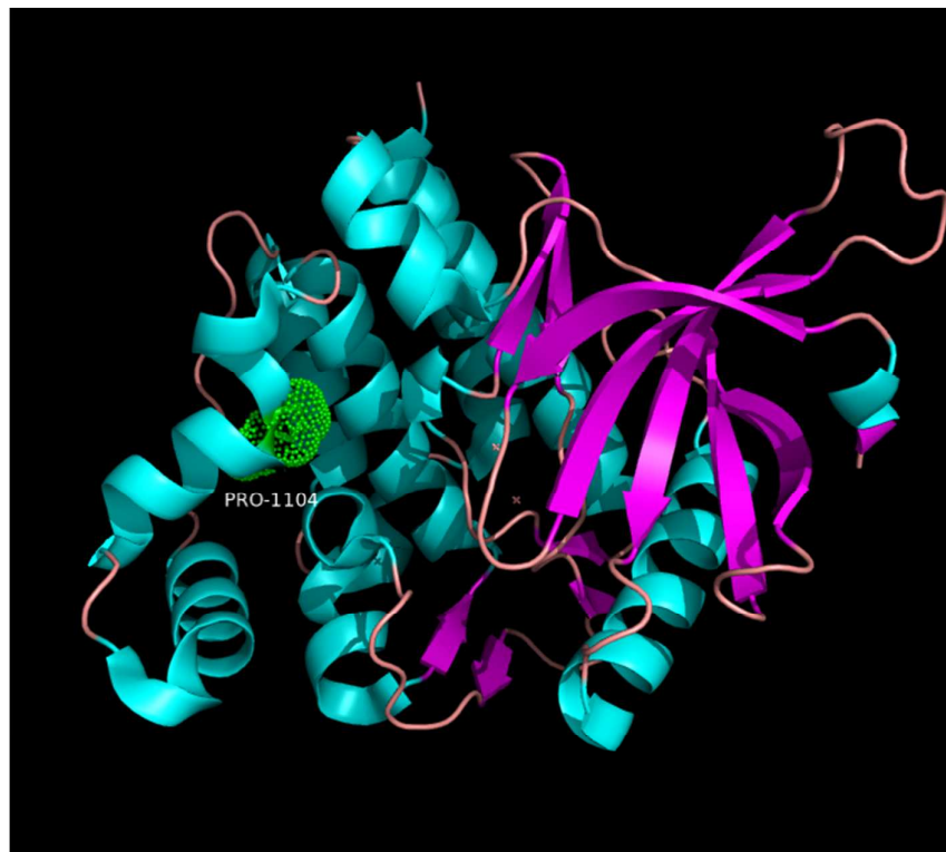
Figure 1: 3D ribbon diagram of the TYK2 native structure (PDB code 4GVJ) containing the position of the P1104A polymorphism. Helical regular segments are represented in cyan and beta strands in magenta color. Diagram created using program PyMol (DeLano et al. Schrodinger Inc).