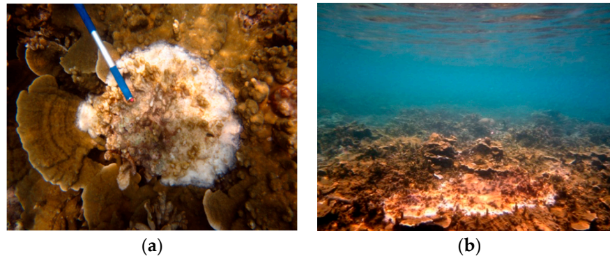
Figure 2. (a) Representative image of Montipora sp. showing signs of BBD, which often started in the centre of the colonies; (b) the majority of colonies showing signs of BBD were found in shallow waters (less than 2 m depth).