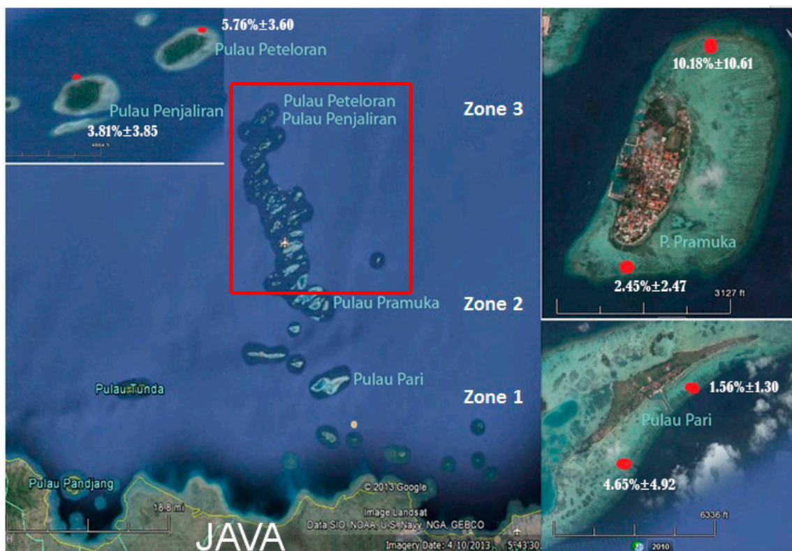
Figure 1. Maps showing the locations of each zone monitored in this study. Zone 1 = nearest sites (Southern Pari and Eastern Pari islands) with a population of 2458. Zone 2 = middle sites (Southern Pramuka and Northern Pramuka islands) with a population of 5123. Zone 3 = farthest sites (Penjaliran and Peteloran islands) as core zone of marine park which no population. The red squares represent the core zone of the Marine National Park area and the red points represent the six study sites with prevalence average of all sampling times of BBD.

The prevalence and incidence of BBD were monitored at reef sites belonging to three different islands in Kepulauan Seribu, an archipelago located near the densely populated island of Java. Island selection (Figure 1) was based on distance from the mainland ( i.e. , Java). Two islands; Southern Pari (05°52'14.0" S, 106°36'38.8" E) and Eastern Pari (05°51'30.5" S, 106°37'25.9" E) represented the nearest sites (Zone 1, 17.99 km from Java), Southern Pramuka (05°45'01.9" S, 106°36'41.5" E) and Northern Pramuka (5°44'24.9" S, 106°37'14.5" E) represented the middle sites (Zone 2, 31.70 km from Java), and Peteloran (05°27'07.6" S, 106°33'44.9" E) and Penjaliran Timur (05°27'34.0" S, 106°33'49.3" E) represented the farthest sites (Zone 3, 63.65 km from Java). Pari Island and Pramuka Island are inhabited, while Peteloran and Penjaliran Timur are within the core zone of the uninhabited National Marine Park (and thus assumed to be an area less exposed to sources of anthropogenic pollution). It should also be noted that fish farming is undertaken to a large extent around Pramuka Island (Zone 2).