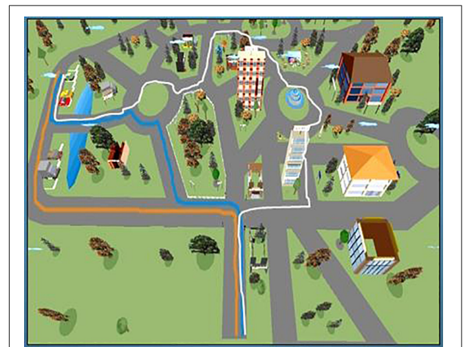
FIGURE 1 | The virtual environment with the original route learned (in white) and the two shortcuts (in blue and orange) correctly identified by 50 (43%) participants.

Table 1 shows descriptive statistics and correlations between all variables, revealing a distinct pattern of correlations between the measures of individual differences, and between these and the two WF tasks. As expected, the two WM tests, the Corsi Blocks Task and the Pathway Span Task, correlated moderately with each other, such as the Corsi Blocks Task and the MRT. Significantly, all these WM and spatial abilities measures showed specific correlations with the number of errors in the route-tracing task. On the other hand, the measures of pleasure in exploring, self-efficacy, and spatial anxiety correlated strongly with each other,