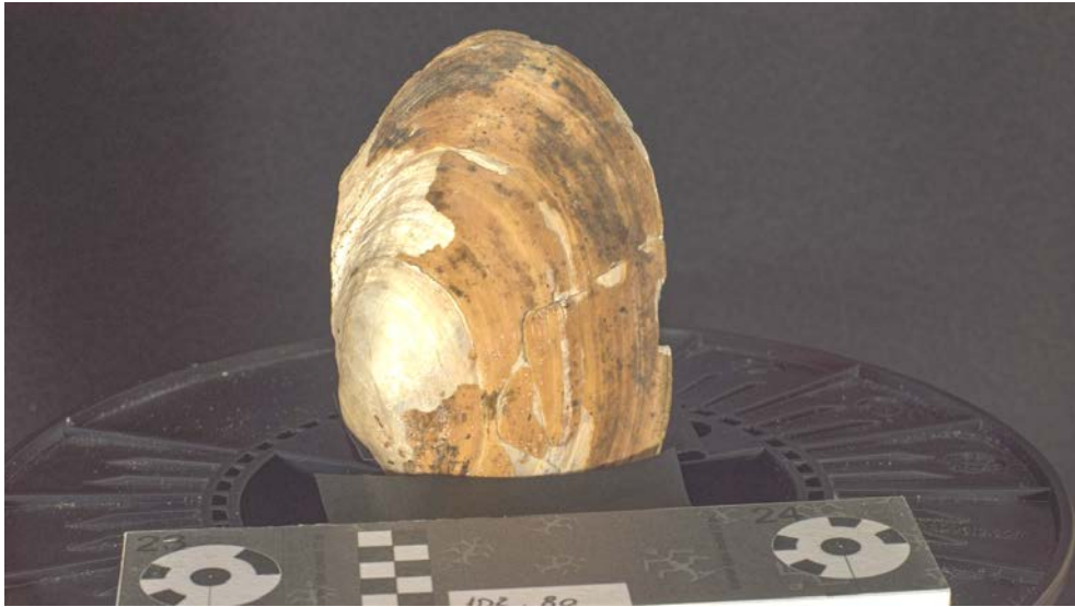
Fig. 1 - The shell stands on one extremity during the first set of photos.