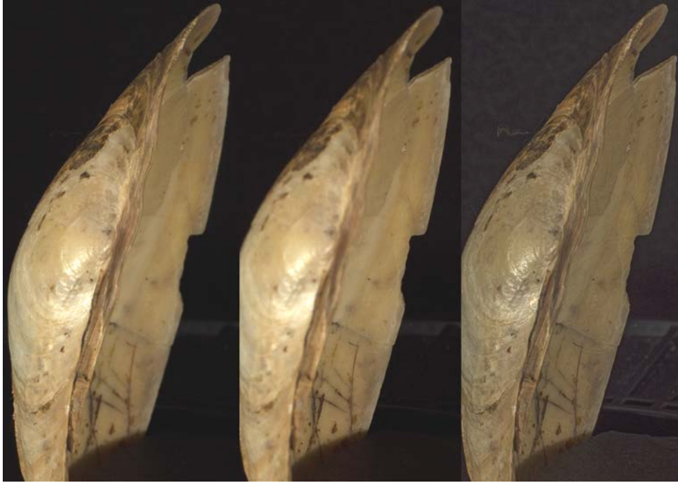
Fig. 3 - Same position on the turntable. Focus on the nearest (left) and on the farther (middle) point of the shell. Focus stacked image (right) with an extended depth of field.