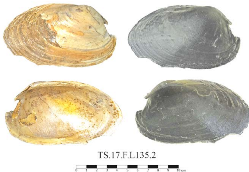
Fig. 10 - TS.17.F.L135.2 and its replica.