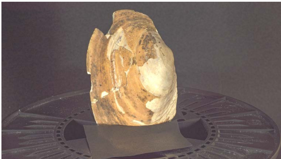
Fig. 2 - For the second set of photos the shell has been rotated upside down.