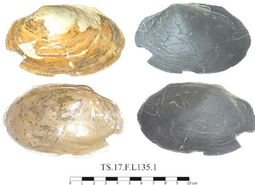
Fig. 9 - TS.17.F.L135.1 and its replica.