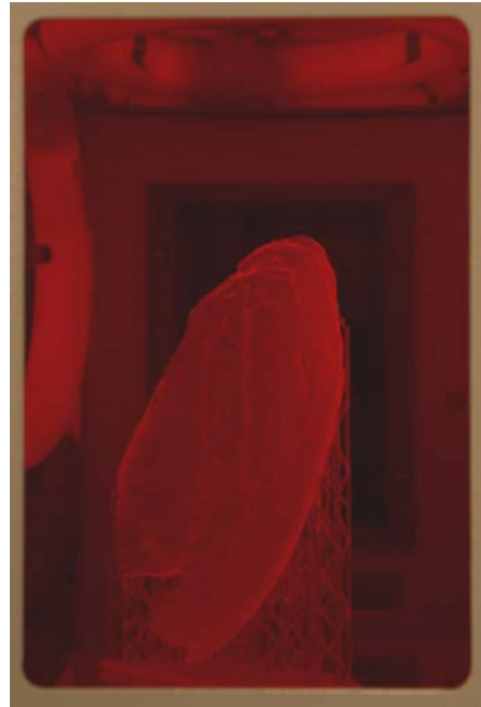
Fig. 6 - The replica in the post curing chamber.