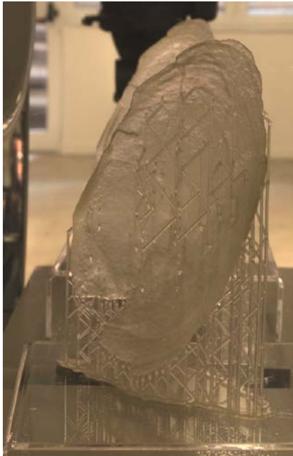
Fig. 5 - The replica with the support scaffolding.