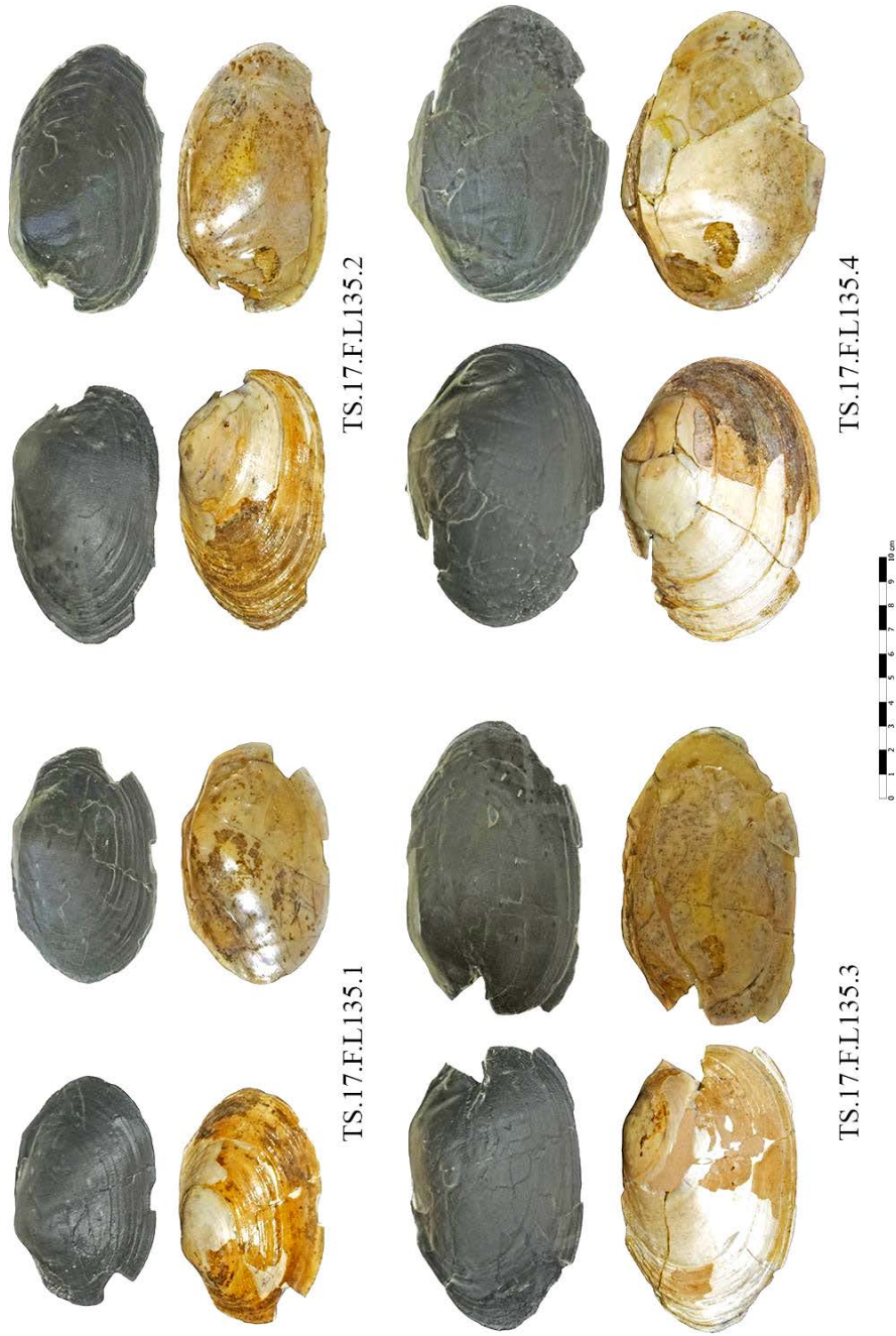
Fig. 8 - The four Nilotic shells from Tell es-Sultan and their replicas (zenith).