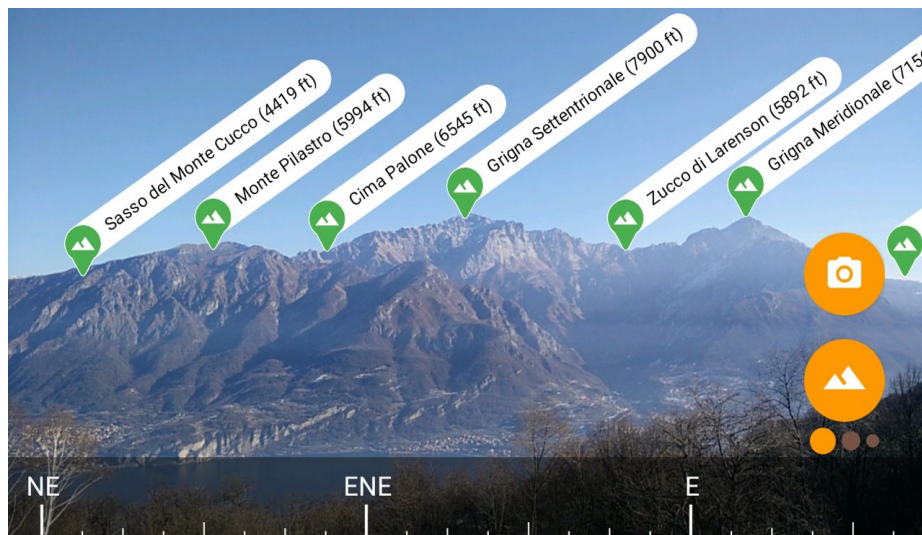
Fig. 1: PeakLens interface: compass orientation (bottom band); photo shooting command (upper button); peak scrolling and peak page indicator (bottom button and 3 circles).