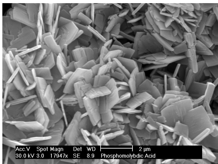
Figure 2. Environmental Scanning Electron Microscopy (ESEM) of H_3PMo_{12}O_{40} . Acc. V: Voltage; Magn: magnification; Det: detector; WD: wide dimension.

However, the obtained polyoxometalated compound showed an interesting behavior. The autoclave treatment of the wood samples in the presence of 10% H_3PMo_{12}O_{40} gave the results reported in Table 4. An impressive increase in the amount of the extractives was observed. The extractives of thermo-treated C. sativa wood increase from 7.6% until 19.9%. The extractives of Q. frainetto pass from 5.3% to 12.3%. Samples of thermo-treated L. decidua gave 1.57% extractives, while, in the presence of “nano” phosphomolybdic acid, 10.7% extractives were obtained. Finally, wood of thermo-treated P. tomentosa gave only 0.93% extractives, and this amount increases until 7.3% in the samples treated in the presence of polyoxometalated molybenum compound.